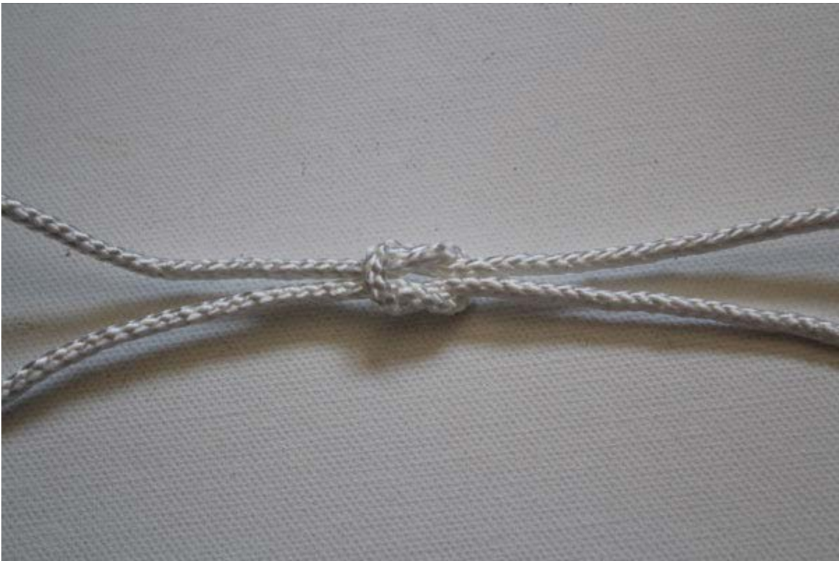
Write the name of the knot with the paint pen.