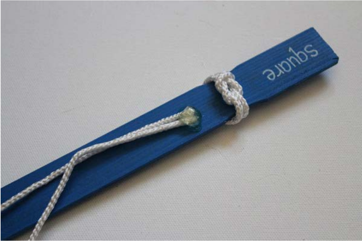
Add a dollop of glue to the end of each of the ropes to keep them from fraying.