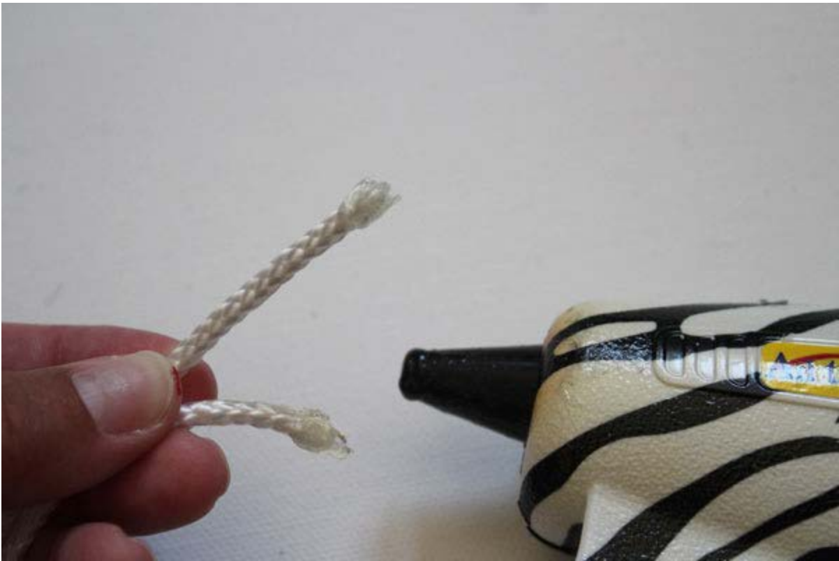
Make as many as you like for all the different knots you want your scouts to practice – a bowline, half-hitch, clove hitch, sheet bend, cat's paw, and more!