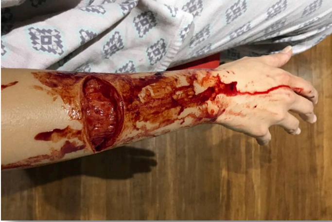
Wound 19: Machete wound to limb