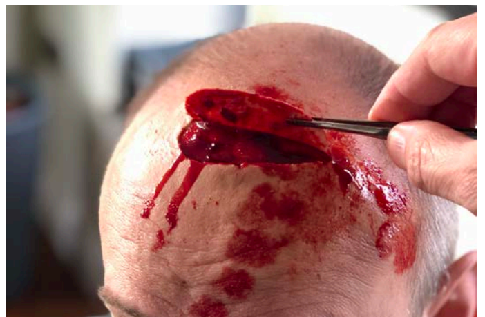
Wound G2 Skin flaps