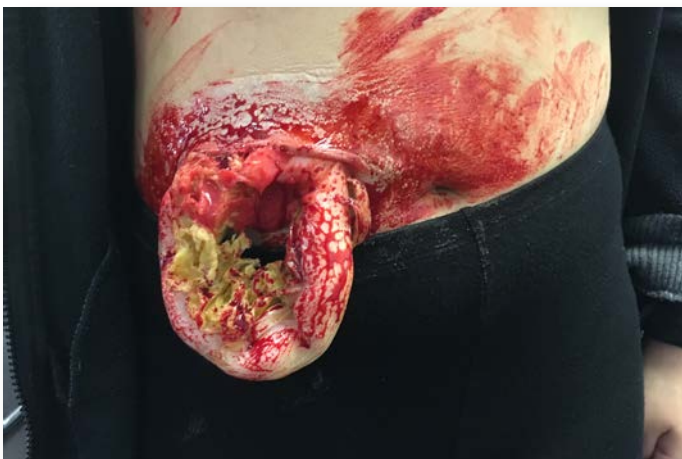
Wound G1 Abdominal wound with intestines