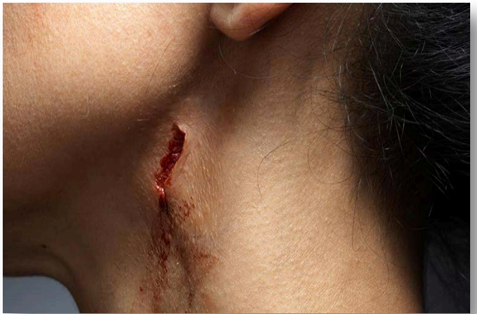
Wound 2: 0.5 inch blade stab wound with angled entry