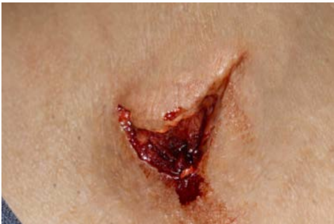
Wound 58: MP5 exit wound at 7m