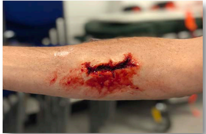
Wound 31: 2 inch generic tissue wound