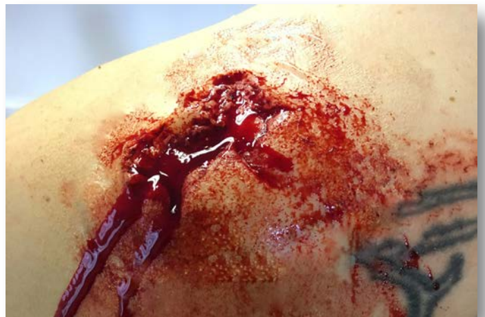
Wound 73: Generic exit wound large