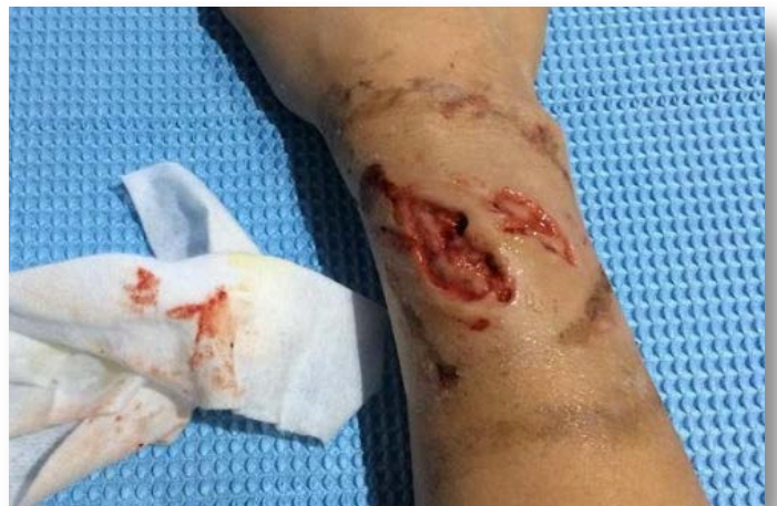
Wound 41: 1 inch necrotic wound