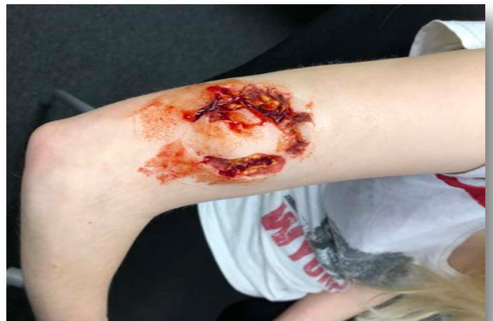
Wound 35: Animal bite wound