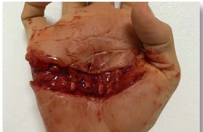
Wound 18: Machete wound to hand