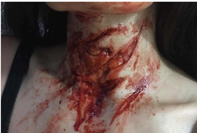
Wound 38: 6 inch large tissue wound to throat