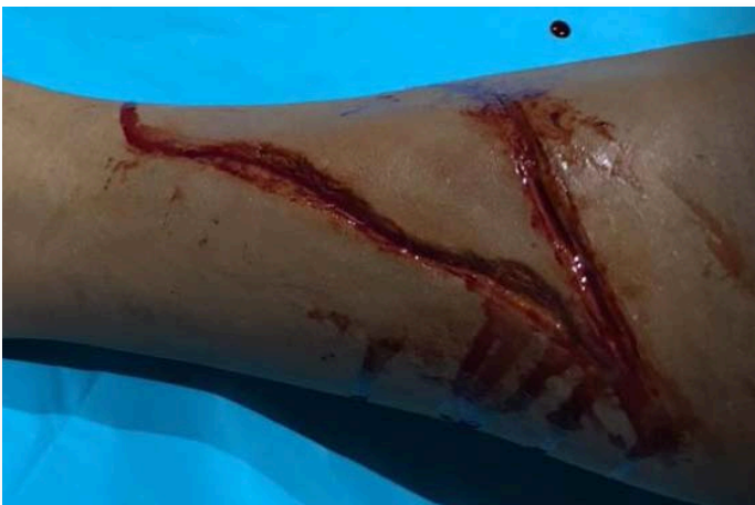
Wound 23: 3 inch and 5 inch slash wound