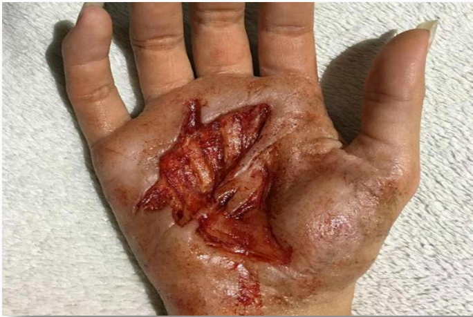
Wound 44: Palm wound