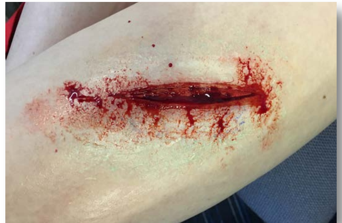
Wound 10: Simple 3 inch laceration