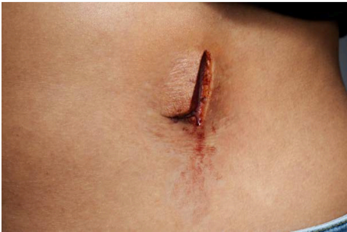
Wound 1: 1 inch blade triangular stab wound with skin flap