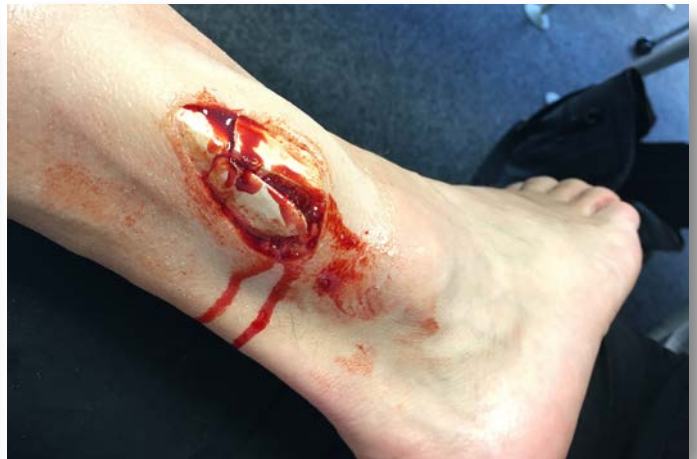
Wound 51: 3 inch open fracture with bone fragments