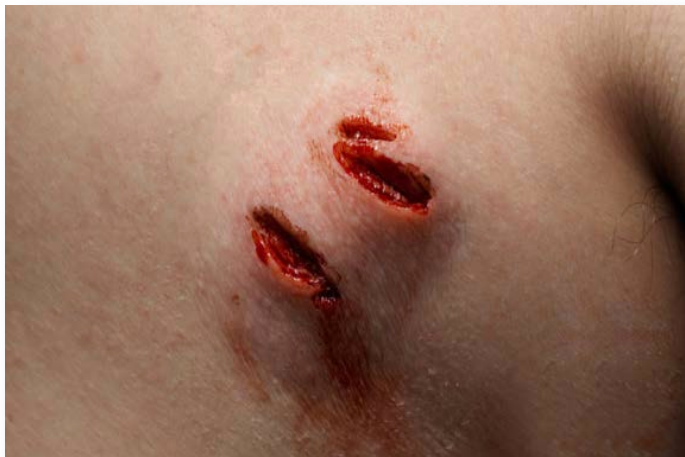
Wound 3: 0.5 inch blade multiple stab wound