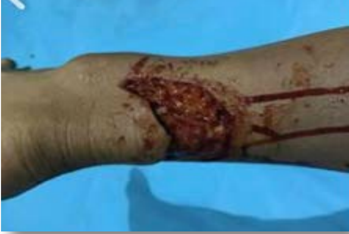
Wound 48: 2 inch ankle flap wound