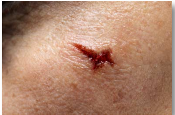
Wound 77: Small individual shrapnel injury