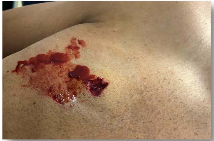
Wound 69: Clean small calibre exit wound