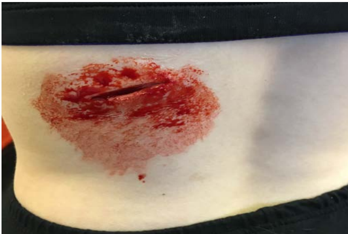
Wound 9: Simple 1 inch laceration