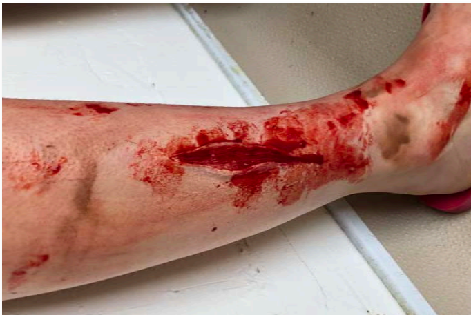
Wound 26: 3 inch generic messy gash