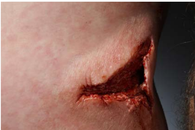
Wound 60: Walther PPK 7.65 angled entry