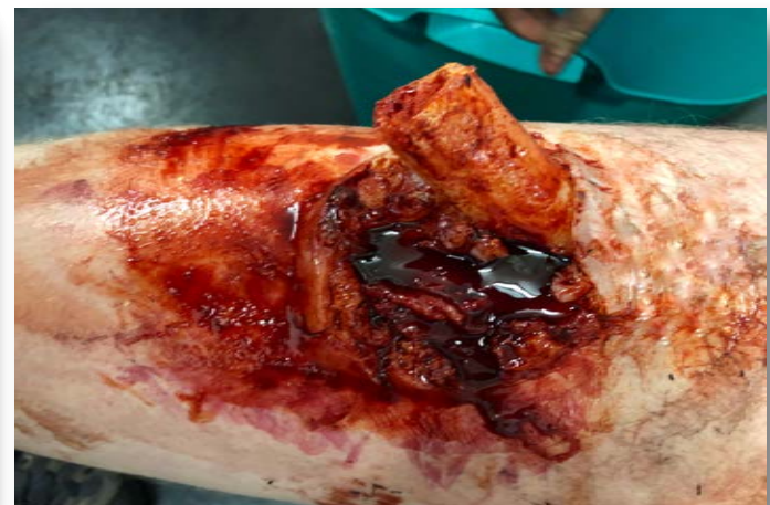
Wound 55: Open femur fracture