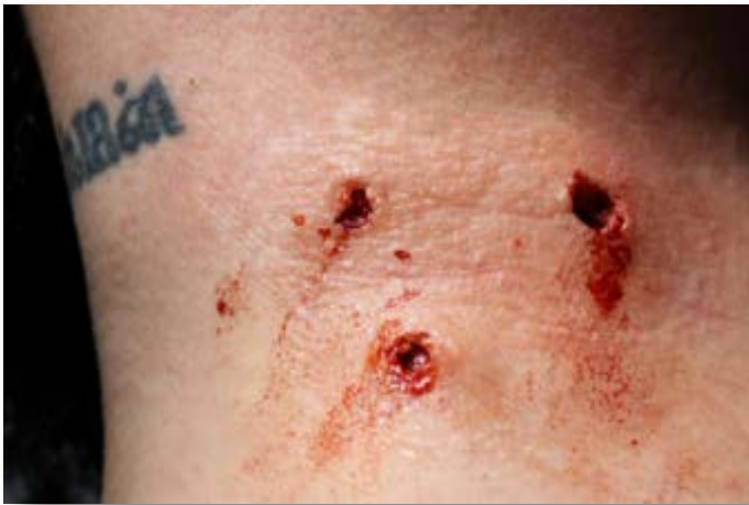
Wound 56: 7.62 triple entry wound