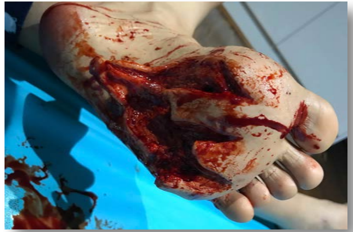
Wound 63: Foot exit wound