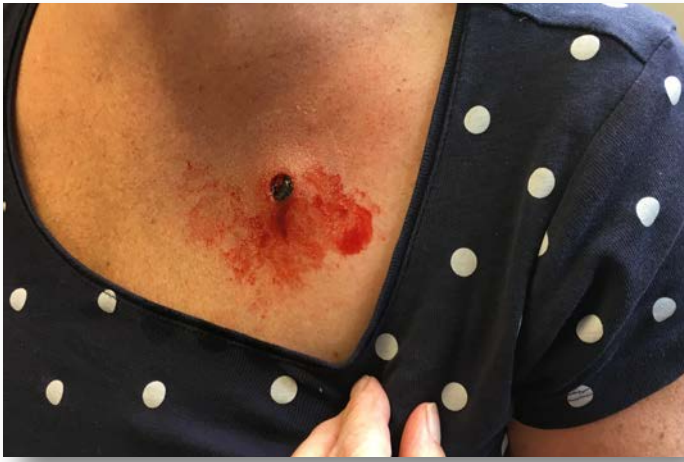
Wound 68: Clean small calibre entry wound