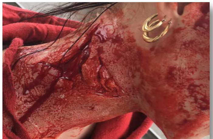
Wound 29: 4 inch generic tissue wound