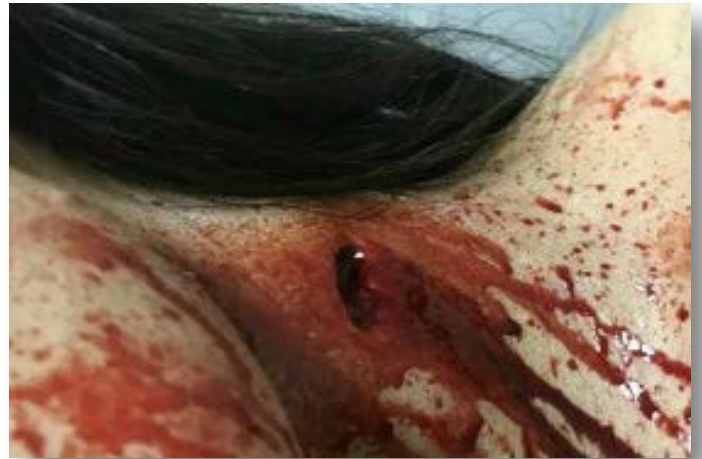
Wound 65: Deeper small calibre entry wound