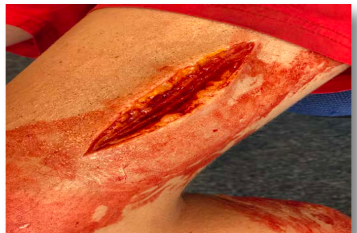
Wound 12: 5 inch laceration plus muscle & fat