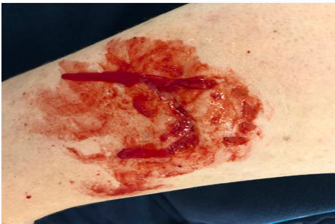
Wound 34: Human bite wound