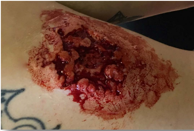
Wound 74: Shotgun entry 1