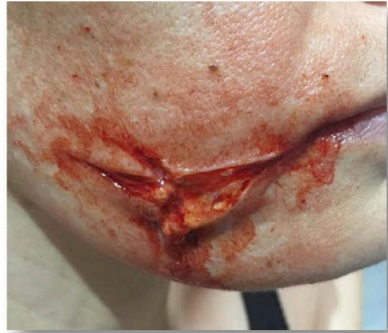
Wound 80: Multipurpose small curved wound #2