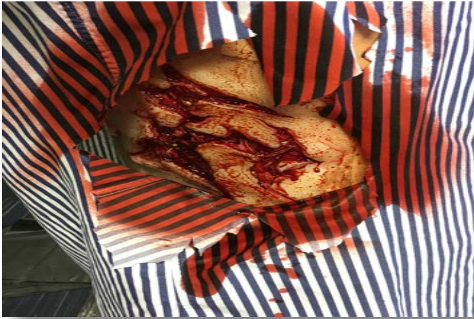
Wound 30: 8 inch large generic tissue wound