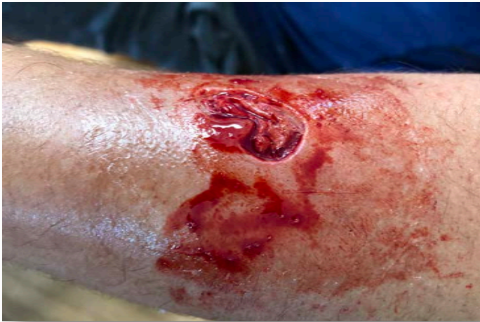
Wound 70: Magnum 45 entry wound