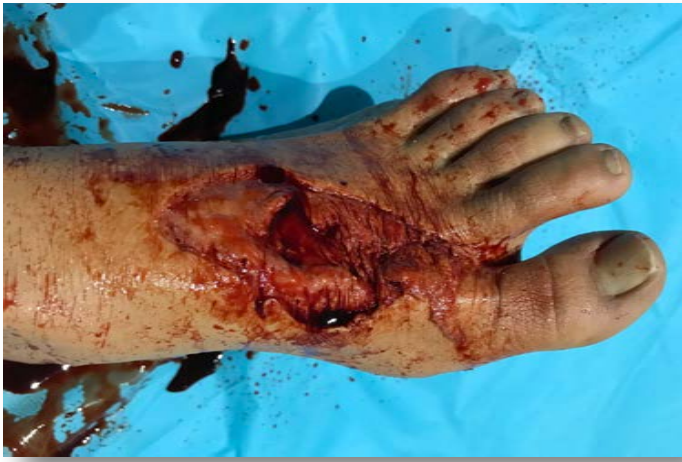
Wound 62: Foot entry wound