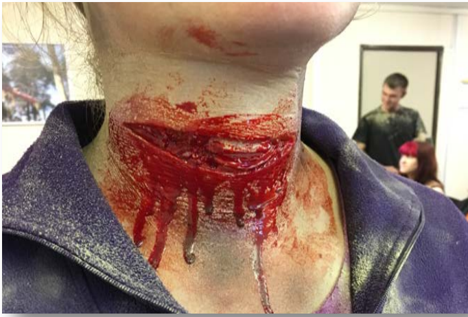
Wound 36: Open throat with visible larynx