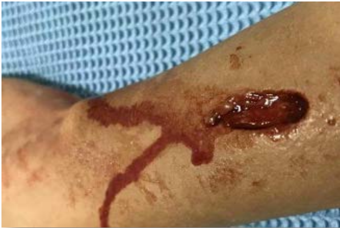
Wound 64: Shallow small calibre entry wound