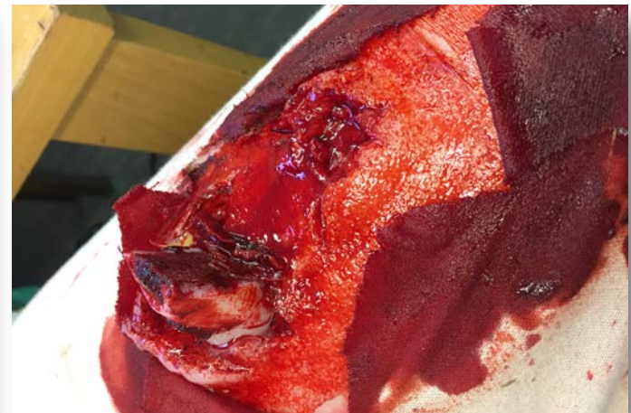
Wound 53: 6 inch generic open fracture