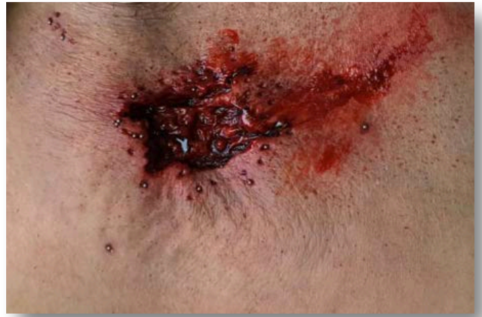
Wound 75: Shotgun entry 2