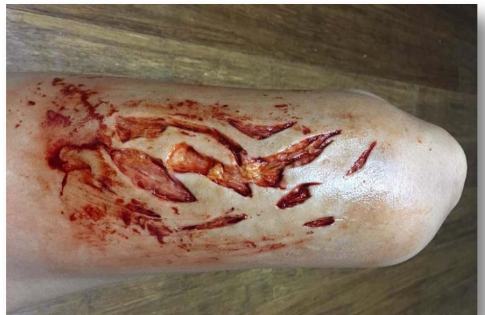
Wound 47: 6 inch medium trauma wound