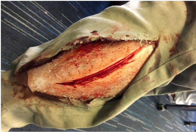
Wound 15: 7 inch sabre slash wound