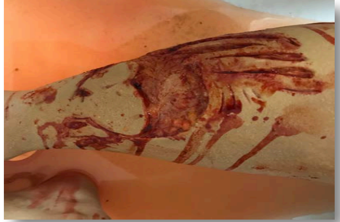
Wound 49: Massive trauma wound / shark bite / prop strike