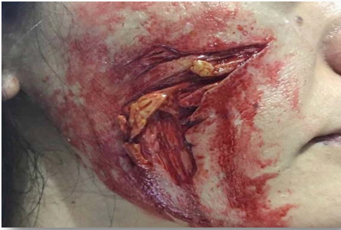
Wound 42: 2 inch cheek wound