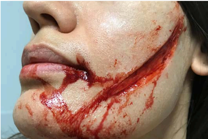
Wound 21: Chelsea Smile style wound - left