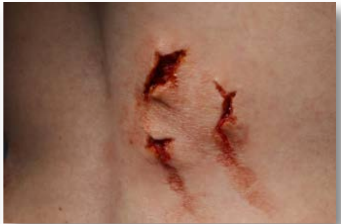
Wound 57: 7.62 triple exit wound