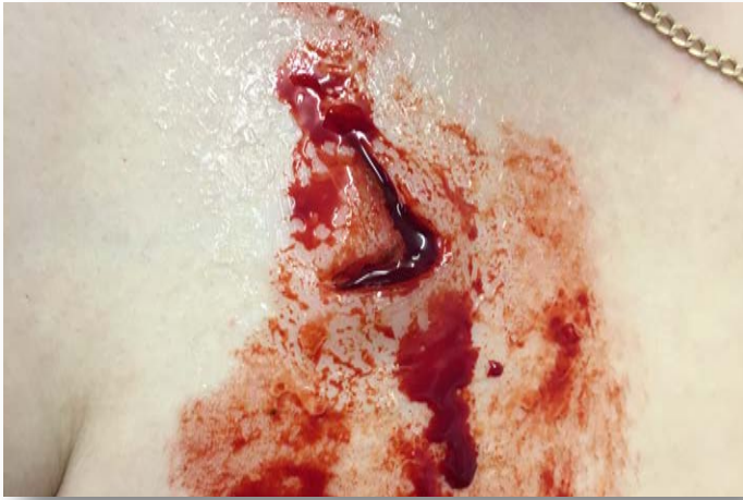
Wound 13: 0.5 inch L shaped blade wound