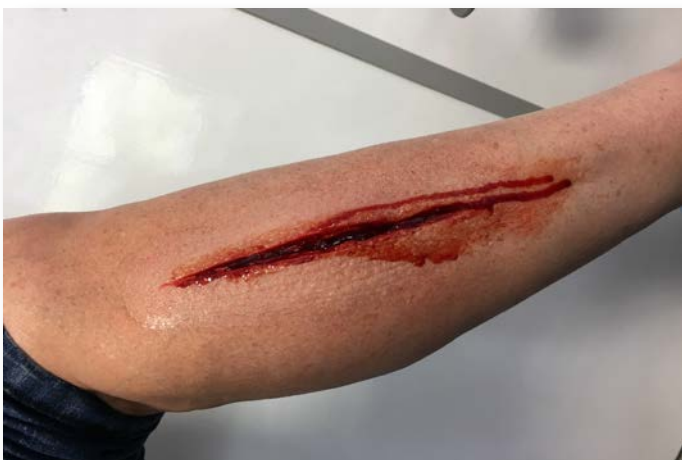
Wound 11: Simple 6 inch laceration