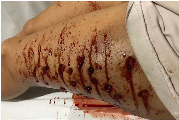
Wound 76: Limb shrapnel injuries