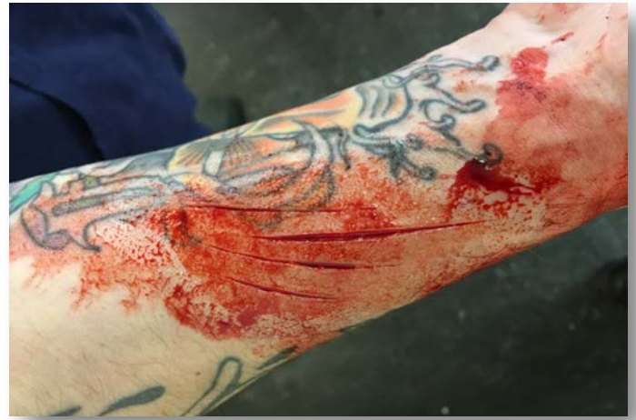
Wound 8: 2 inch fine-blade deliberate self harm wounds