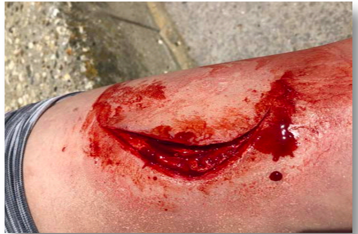
Wound 16: 4 inch wound with skin flap