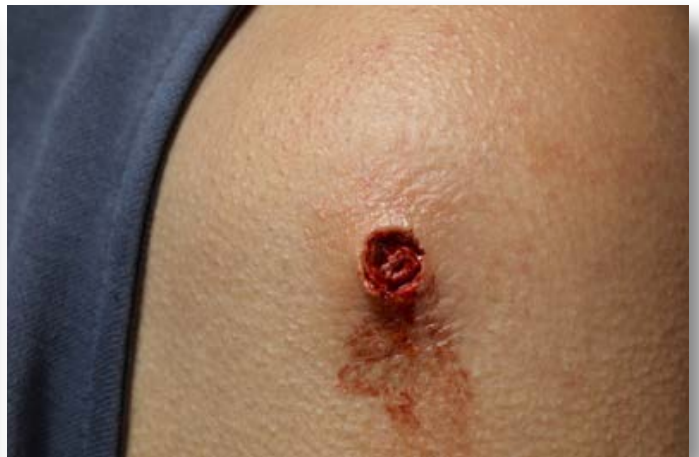
Wound 59: 7.56 entry wound at 7m