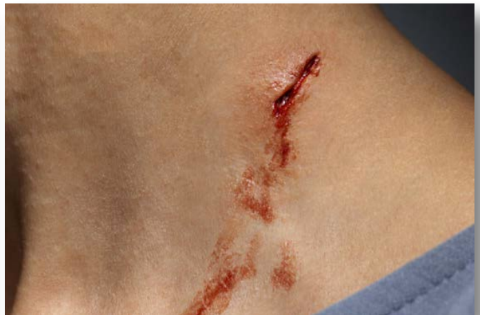
Wound 4: 0.5 inch blade stab wound