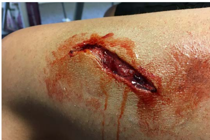
Wound 5: 3 inch deep dagger slash wound