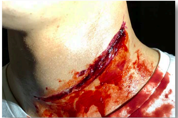
Wound 37: 6 inch jagged slit throat wound