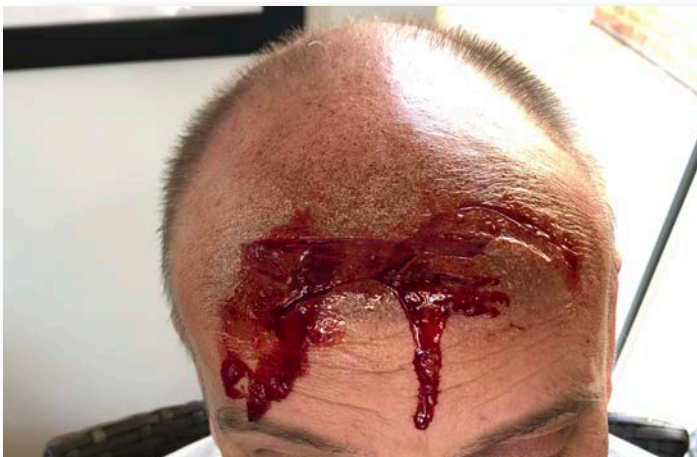
Wound 40: 6 inch forehead wound