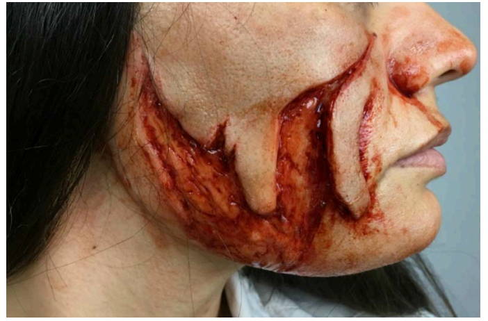
Wound 43: 4 inch cheek wound