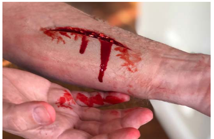
Wound 78: 2 inch slash wound with fat