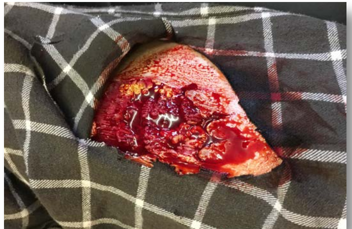
Wound 27: 4 inch flesh tear / animal bite