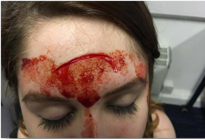
Wound 7: 2 inch curved laceration