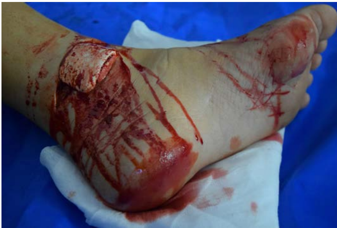
Wound 50: Open ankle fracture with bone fragment