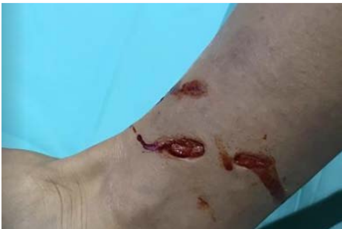
Wound 66: Triple entry or exit / through and through wound