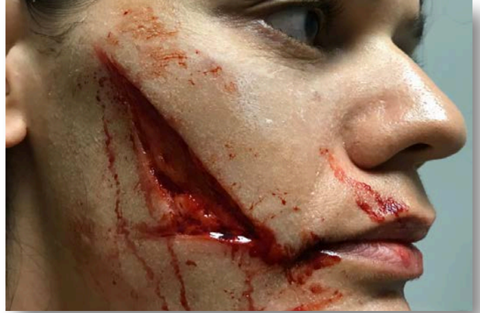
Wound 20: Chelsea Smile style wound - right