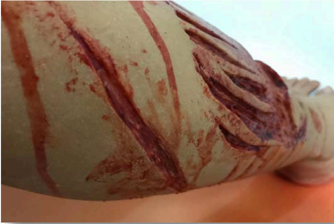
Wound 49: Massive trauma wound / shark bite / prop strike