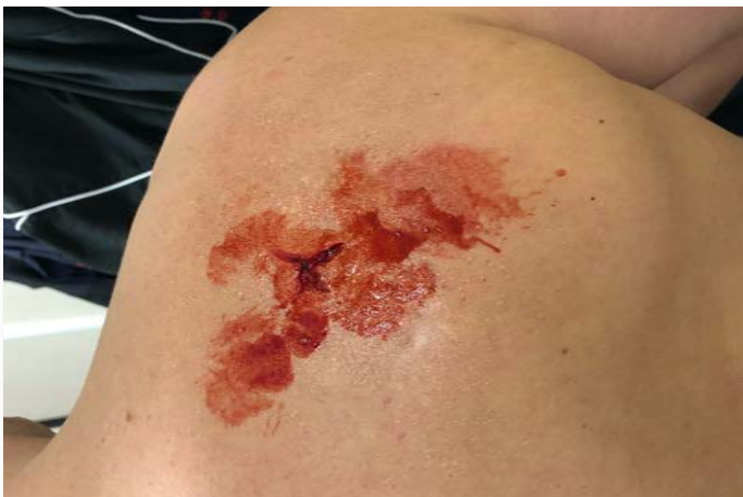
Wound 72: Generic exit wound - small