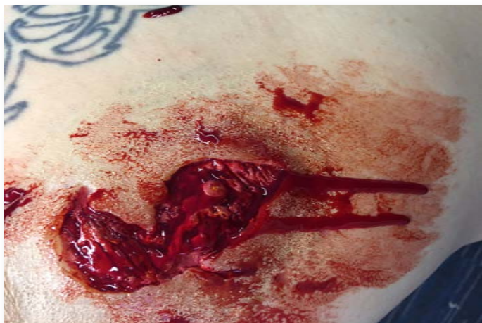
Wound 28: 3 inch generic tissue wound