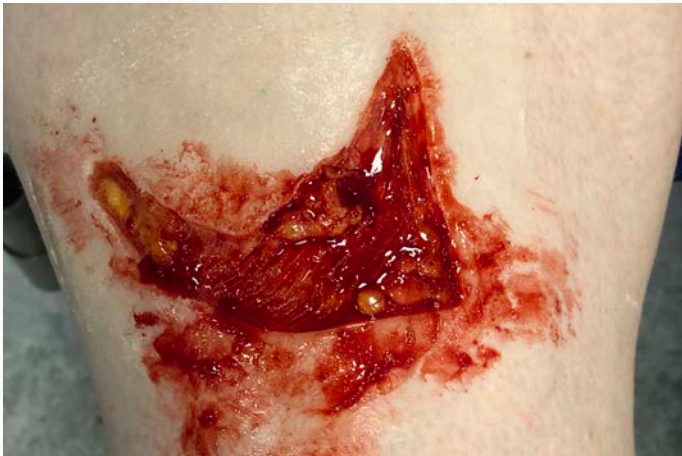
Wound 32: 5 inch de-gloved style wound