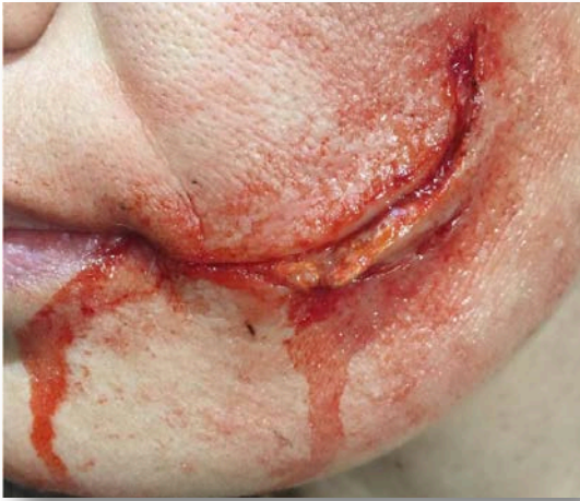
Wound 79: Multipurpose small curved wound #1