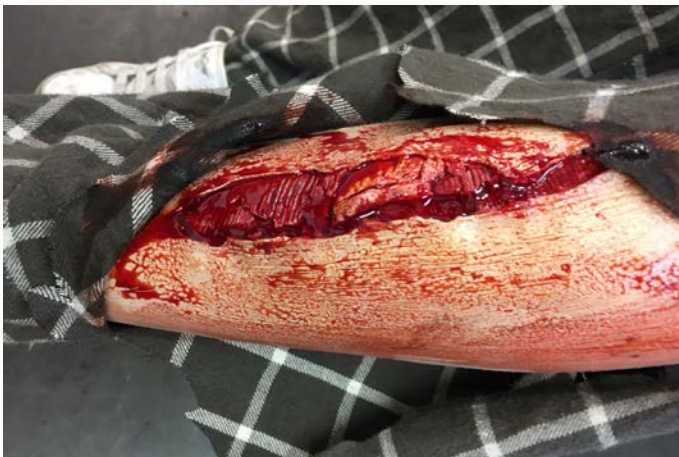
Wound 52: 6 inch open tibial fracture