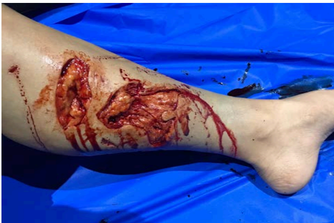
Wound 46: 12 inch large trauma wound