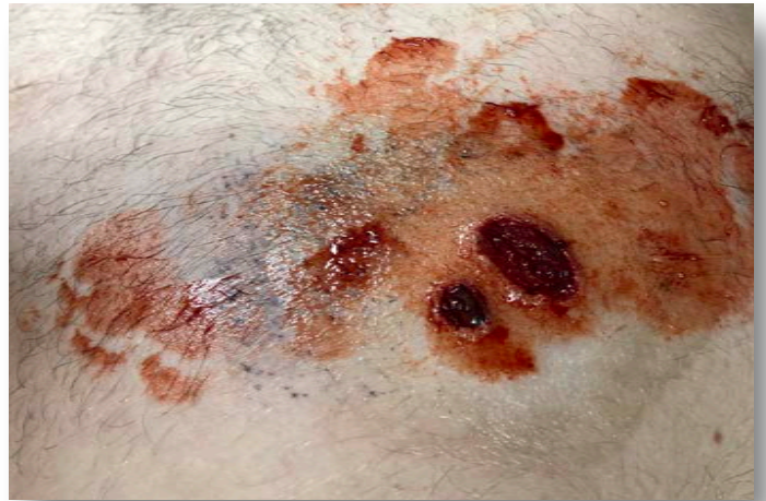
Wound 71: Double tap entry wound