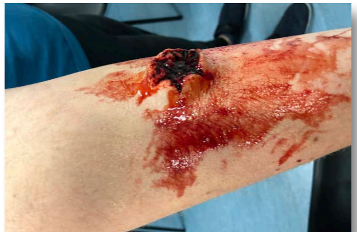
Wound 67: Raised exit wound