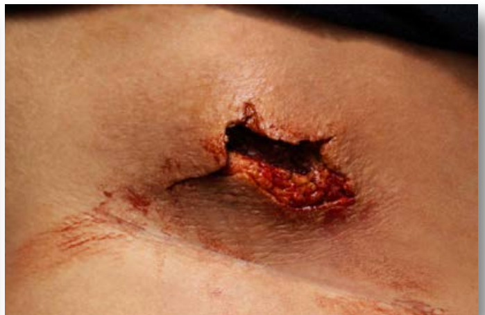
Wound 61: Walther PPK 7.65 angled exit