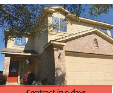
Contract in 9 days