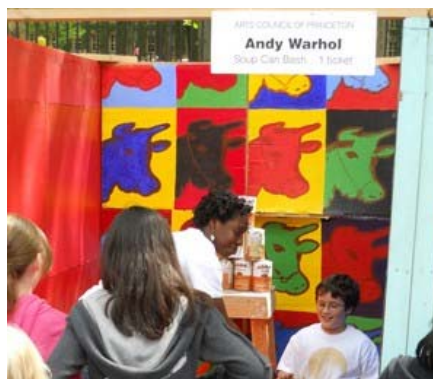
An exhibit inspired by Andy Warhol at last year's Communiunity.