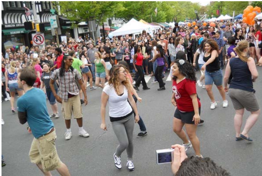
A scene from last year's Communitersity in Princeton. Organizers of the festival say attendance reached 40,000 in 2011.

This weekend, Princeton will celebrate Communitersity, the largest community arts festival in the central New Jersey region.