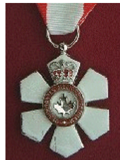
Member of the Order of Canada

In June 1975, Ben Weider was presented with Canada's highest honor, the Order of Canada, by Governor-General the Right Honorable Jules Leger. The Order of Canada is Canada's highest civilian honour, with membership awarded to those who exemplify the Order's Latin motto Desiderantes meliorem patriam , which means "Desiring a better country." Created in 1967, the Order was established to recognize the lifetime contributions made by Canadians who made a major difference to Canada. The Order also recognizes efforts made by non-Canadians who have made the world better by their actions. Musicians, politicians, artists, television and film stars, benefactors, and many more have been accepted into the Order. The Queen of Canada, Queen Elizabeth II, is Sovereign of the Order and the serving Governor General of Canada is its Chancellor and Principal Companion.