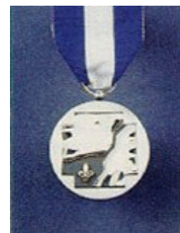
Knight of the Order of Quebec

In March 2000 , Ben Weider received the highest award that can be bestowed upon a resident of the province of Quebec, Knight of the National Order of Quebec, in a ceremony presided over by the right honorable Lucien Bouchard, Premier of Quebec.