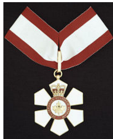
Officer of the Order of Canada

In December 2006 , His Honor the Mayor of Jefferson Country (Tennessee, USA), proclaimed the 8th