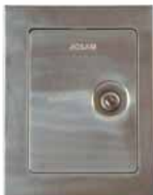
Stainless Steel (Standard)