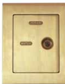
S.F. Bronze Face (-52)