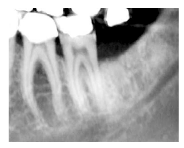
After extraction and grafting