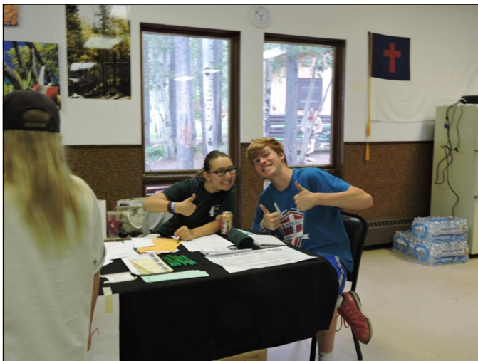
Two of the volunteers that made 'Eclipse in the Lodgepole' a success.