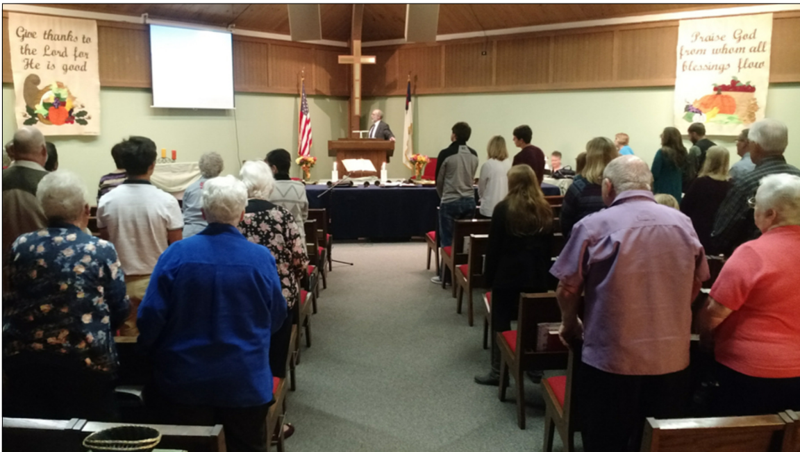
Congregation of Glenrock Community Baptist Church sings hymn at closing of centennial worship service.