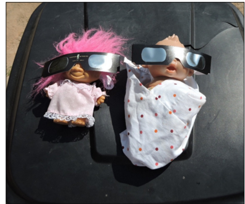
Two guests waiting for totality.