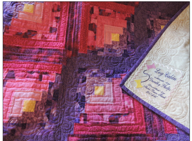
Beautiful quilt that is being raffled to support Camp Wyoba.