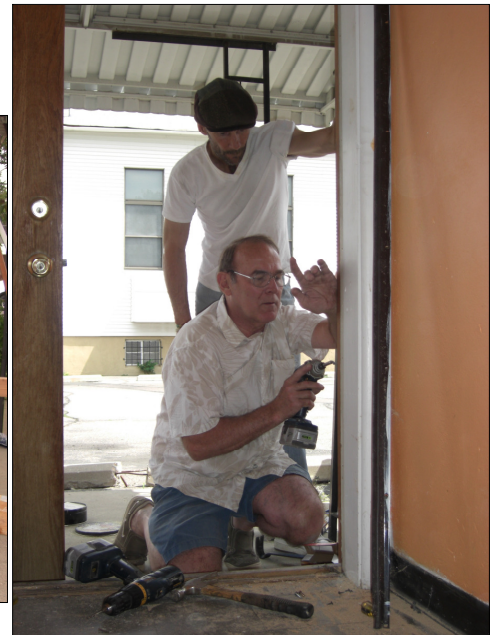
Volunteers from Crossroads American Baptist Church have provided much needed assistance in making repairs to the property of the old Aurora Community Baptist Church which currently houses the ministries of Ebenezer Ethnic Baptist Church (Karen) and Iglesia Palabra de Fe (Hispanic).