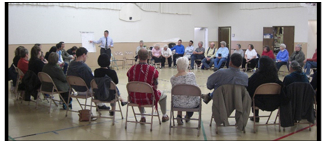
This workshop on refugee resettlement at First Baptist Delta is one of many that the Schweissings facilitated around the region.