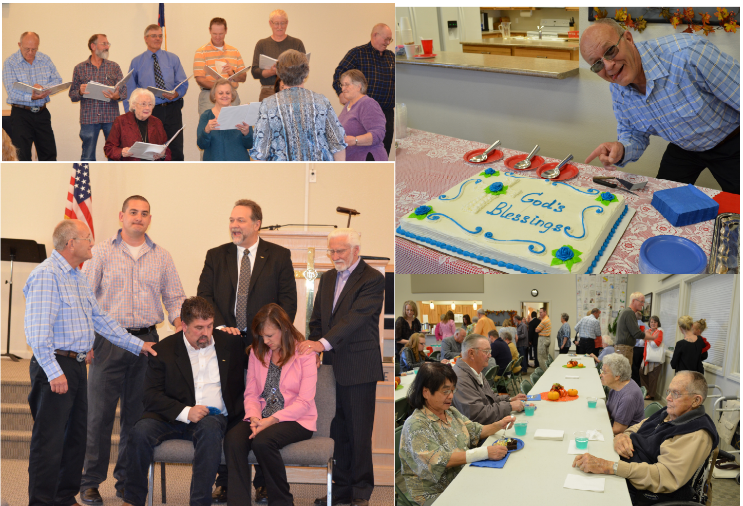
Bottom left picture: