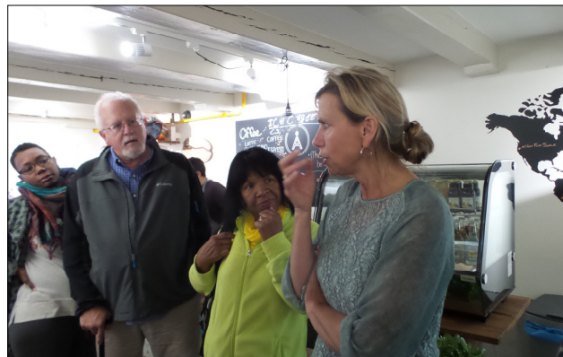
Team listening to work of Woman who leads organization to help women caught in trafficking.