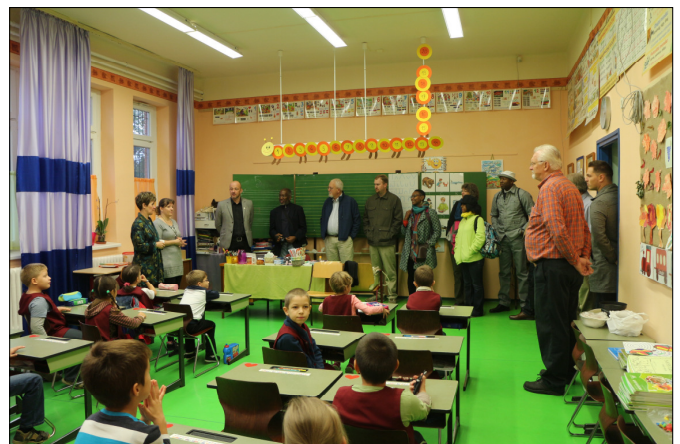
Team visiting a class in the school.