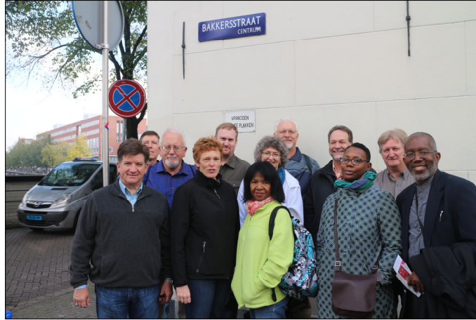
Team at sight of "Baptist" origins in Amsterdam

The legacy of WWII and its aftermath remains important in the mind of the people of Hungary, and to some extent in the Netherlands. We visited the Ten Boom House and saw the "Hiding Place." We visited the Museum of Terror which remembers the terror of the Fascist and Communist regimes in Hungary. We saw the Shoe Memorial along the Danube which remembers the Jews who were lined up, shot, and their bodies dumped in the river. I was part of the team that went to a church in Budapest. That church had been bombed during WWII. It had its pastor exiled from Budapest and most of its building used by the Communist Party Leadership during the Soviet