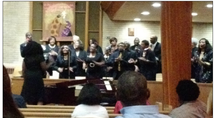
Macedonia Baptist Church Choir