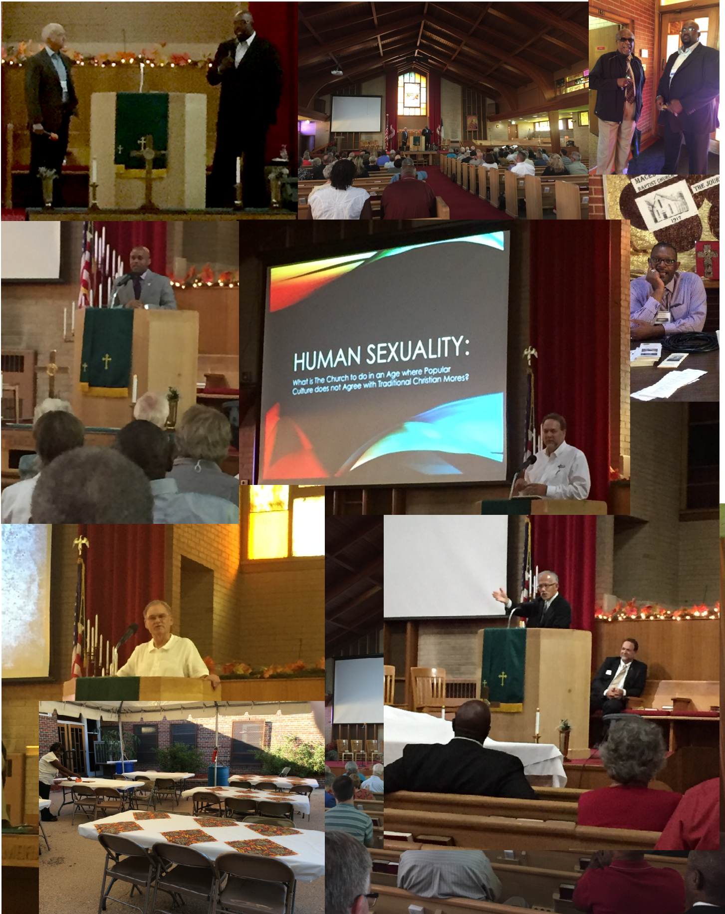
What's in this RMAB?