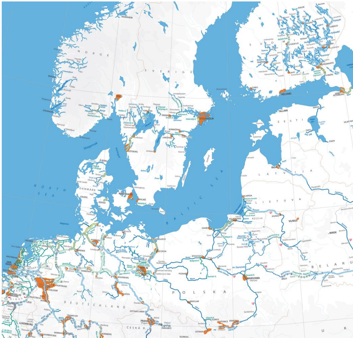
FIGURE 2 - IMPORTANT ECONOMIC AREAS CONNECTED TO INLAND WATERWAYS. REMARK FOR SWEDEN: INLAND NAVIGATION IS TIME BEING ALLOWED IN LAKE MÄLAREN AND LAKE VÄNERN INCLUDING GÖTA RIVER.

Using inland navigation and river-sea shipping is a way to shift transport of goods from road to waterways in future. The navigable inland waterway network within the EU exceeds 40 000 km 5 and covers all important economic areas in Central Europe. Many industrial and population centres are located along inland waterways. Half of Europe's population lives close to the coast or to inland waterways and most European industrial centres can be reached by inland navigation and river-sea shipping.