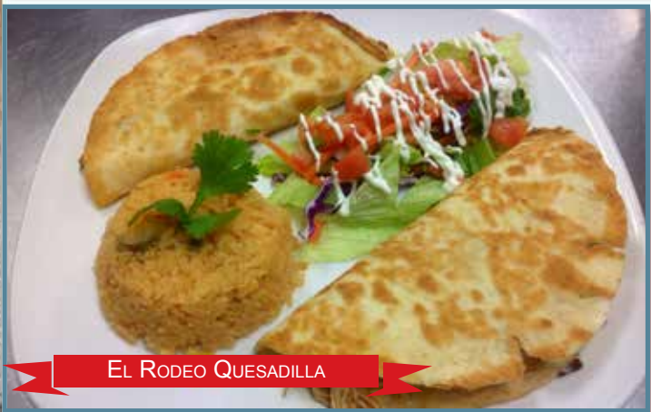
EL RODEO QUESADILLA