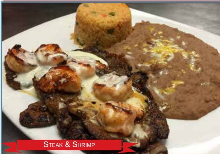
STEAK & SHRIMP