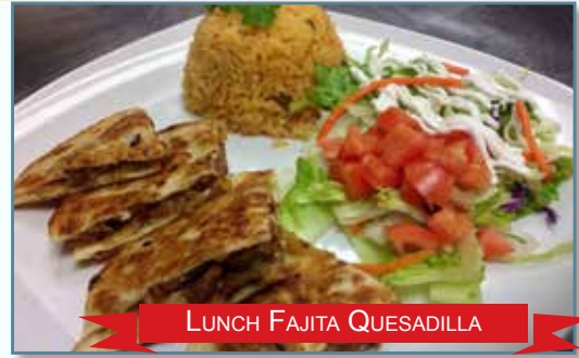
LUNCH FAJITA QUESADILLA

Two taquitos with tender spicy beef or chicken wrapped in corn tortillas and deep-fried. Topped with salsa, crema fresca and queso fresco. Served with a salad, sour cream, tomatoes and rice - 8.25