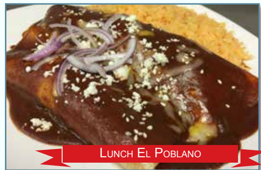
LUNCH EL POBLANO