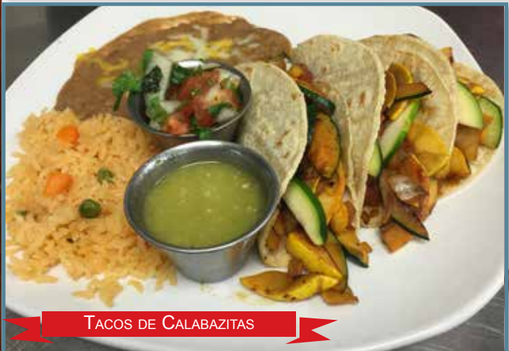
TACOS DE CALABAZITAS