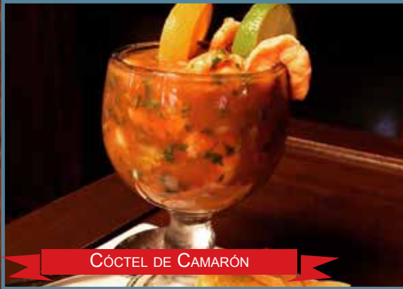
CÓCTEL DE CAMARÓN