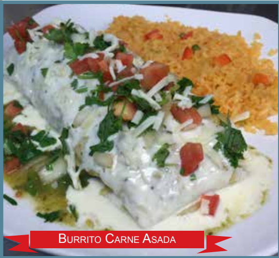
BURRITO CARNE ASADA