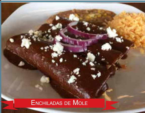
ENCHILADAS DE MOLE