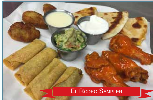
EL RODEO SAMPLER