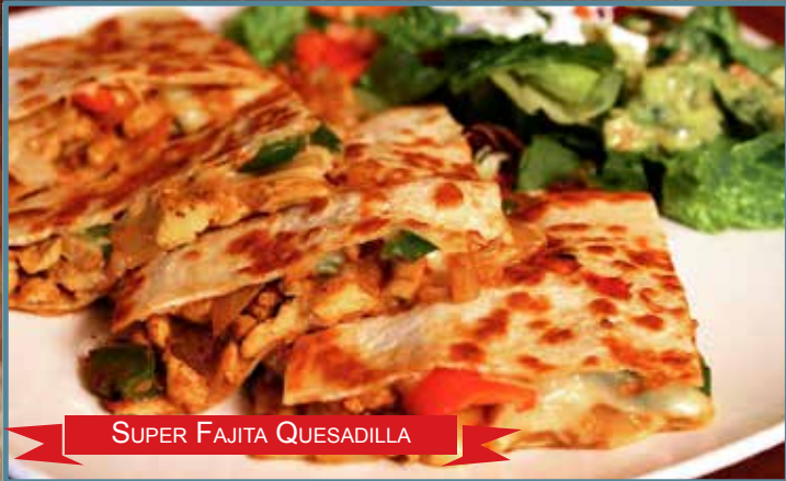
SUPER FAJITA QUESADILLA