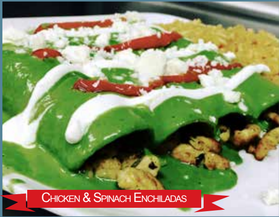
CHICKEN & SPINACH ENCHILADAS