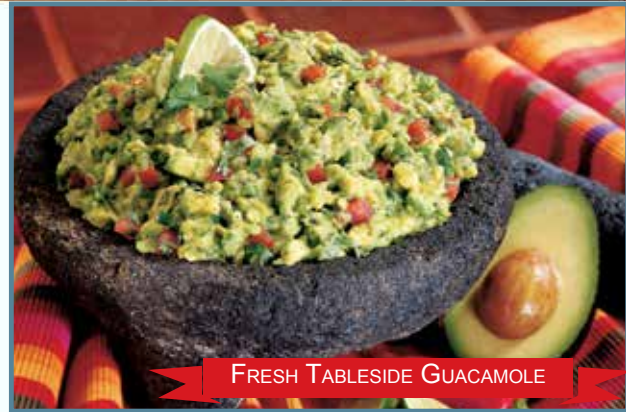
FRESH TABLESIDE GUACAMOLE

Crisp tortilla chips loaded with chicken, beef, beans and cheese dip. Topped with lettuce, sour cream and sliced tomatoes - 11.25