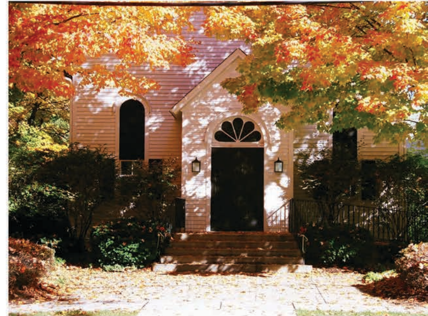
Little Home Church by the Wayside