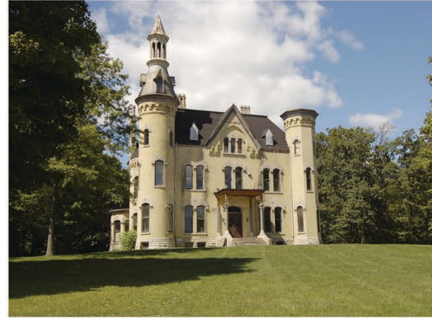
The Wayne Dunham Castle