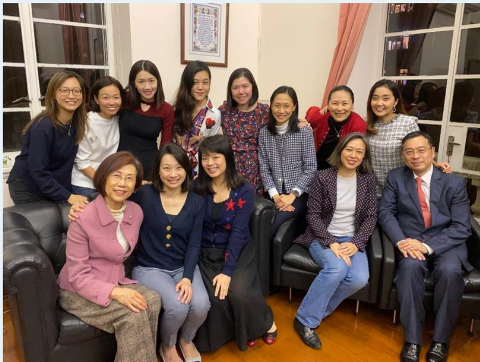
SSGCAA Executive Committee (2019-2020)