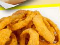
Homemade Onion Rings