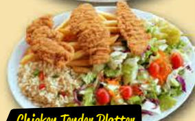
Chicken Tender Platter