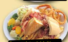
Pastrami Sandwich Platter