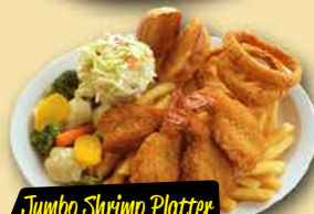
Jumbo Shrimp Platter