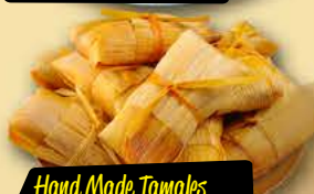
Hand Made Tamales