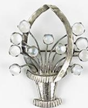
This Austrian 7½" long sterling silver and moonstone bracelet containing nine round cabochon moonstones sold together with a moonstone flower basket brooch containing 11 round moonstones for $218.75 (est. $75/125) to the buyer of the lot with the Egyptian Revival jasper necklace, the German jasper, marcasite, and sterling ring, and the jasper, marcasite, and silver brooch.