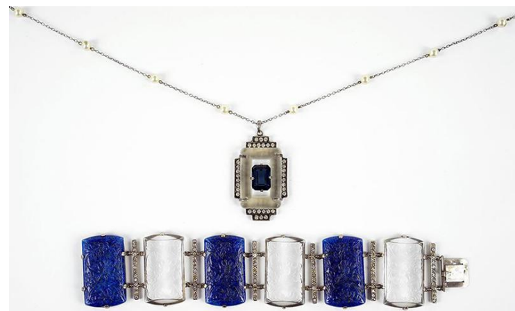
This 7" long French silver and paste bracelet sold along with this French Art Deco paste, faux pearl, and silvertone necklace for $593.75 (est. $100/200) to the same bidder who bought the top lot as well as several other pieces featured here.