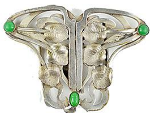
Three Art Nouveau ribbon buckles—a silver 2" x 4 1/2" bow ribbon buckle hallmarked with a crescent, crown, "800," and a spoked wheel; a pewter with amethyst cabochon buckle; and a free-form leaf buckle containing green cabochons—realized $250 (est. $100/150).