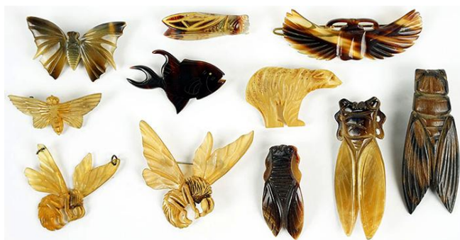
The buyer of the Drendel brooch (seen below right) also bought this lot, which included three Art Nouveau carved horn flying insect brooches; one Art Nouveau carved horn insect pendant; four French carved horn brooches; one carved horn fish brooch; and two carved wood insect brooches for $531.25 (est. $150/250).