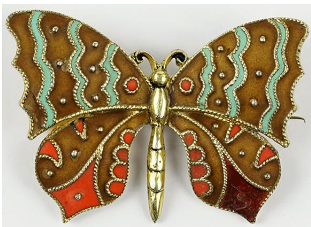
This Theodor Fahrner 1 1/2" silver and matte enamel butterfly brooch, stamped with maker's mark and "935" on reverse, brought $250 (est. $50/100).