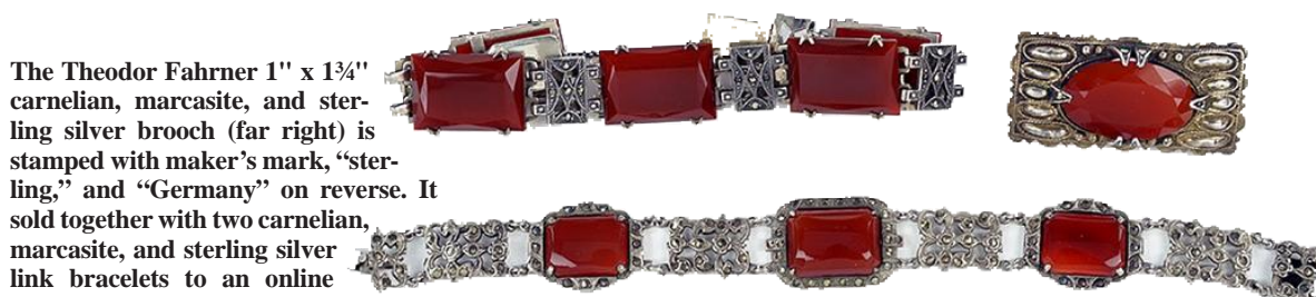
The Theodor Fahrner 1" x 1¼" carnelian, marcasite, and sterling silver brooch (far right) is stamped with maker's mark, "sterling," and "Germany" on reverse. It sold together with two carnelian, marcasite, and sterling silver link bracelets to an online bidder for $352.