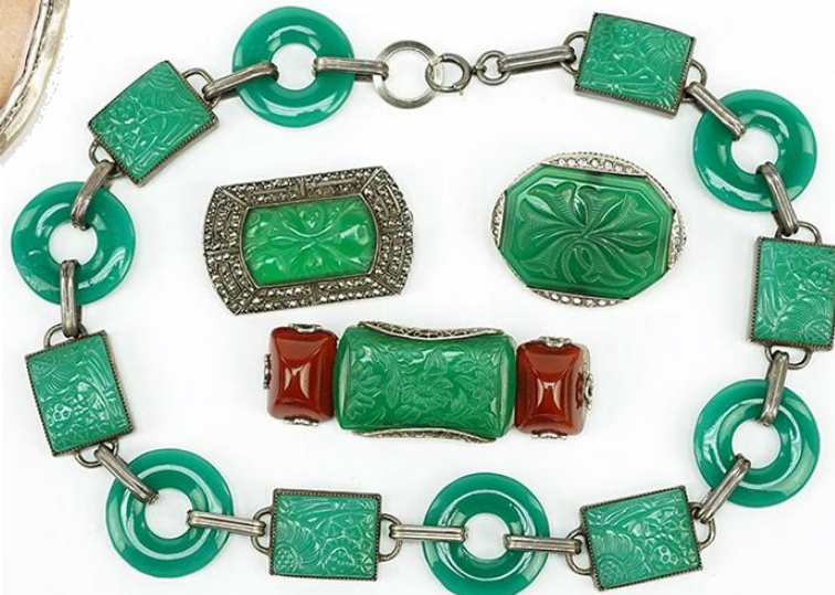
This Art Deco sterling silver and green paste choker necklace sold together with two Art Deco marcasite, silver, and carved green paste brooches and one additional sterling silver and green and red paste brooch for $281.25 (est. $150/250).