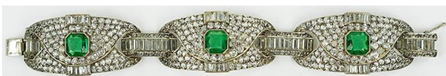
An online bidder won this Knoll & Pregizer sterling silver and paste bracelet containing three square green paste stones, each surrounded by both round and baguette white paste stones. The 7" long bracelet, stamped with maker's mark, "sterling," and "Germany" on the clasp, sold for $608 (est. $200/300).