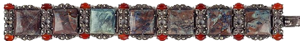
The top lot of Susanin's sale was this German Art Deco 7½" long jasper, carnelian, marcasite, and silver bracelet (top) containing seven jasper stones and 16 carnelian stones, together with a German coral, green onyx, and silver bracelet containing five coral stones and five square-cut green onyx stones, which brought $625 (est. $150/250).