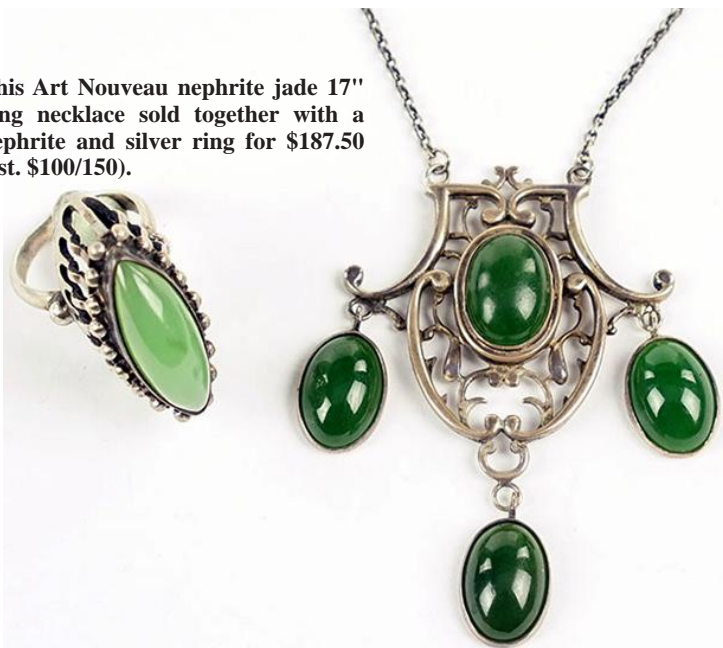
This Art Nouveau nephrite jade 17" long necklace sold together with a nephrite and silver ring for $187.50 (est. $100/150).