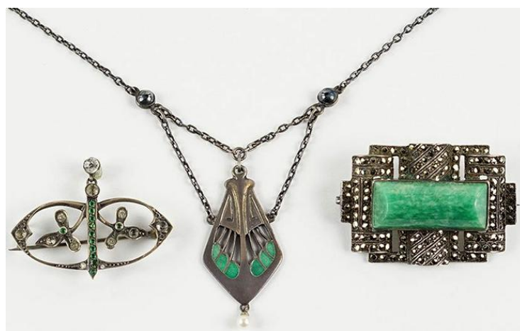
This Art Nouveau silver, enamel, and cultured pearl necklace with a 23" chain and 1¾" pendant (middle) sold together with these two Art Deco marcasite, silver, and paste brooches for $343.75 (est. $150/250).