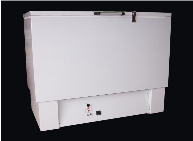
Standard 12 cu. ft. Freezer