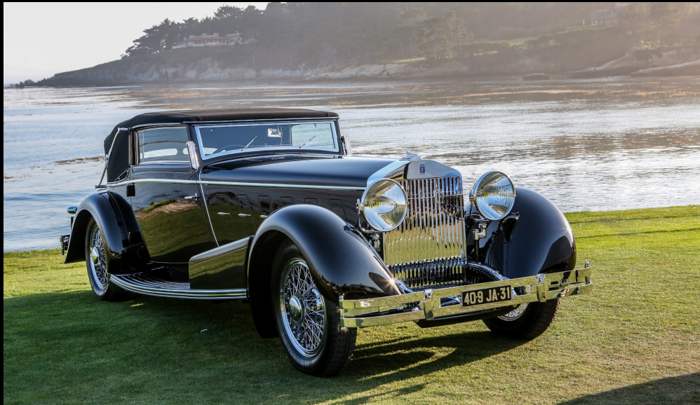
1924 Isotta Fraschini Owned By Jim Patterson and Restored By RM Auto Restoration. Won both First in Class and Best of Show at Pebble Beach 2015! SPI Black Epoxy and Universal Clear.