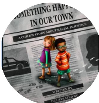
Book: Something Happened In Our Town