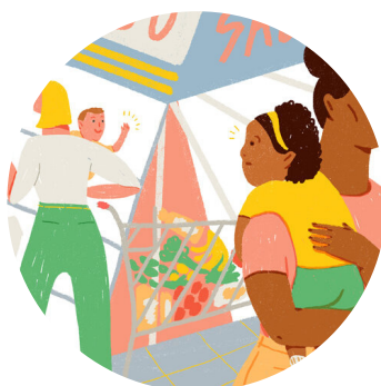
NPR: Talking Race with Young Children