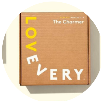
LOVE EVERY Resource List