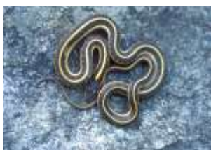
Common Garter Snake