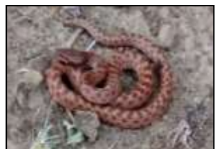
Desert Night Snake