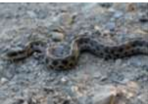
Terrestrial Garter Snake