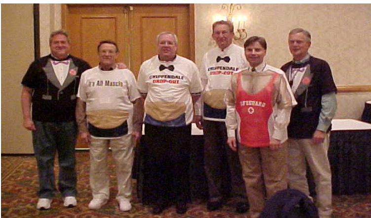
Left: The Clerk N Dales were a great entertainment value during the door prize drawings at Spring Conference.