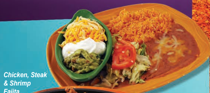
Chicken, Steak & Shrimp Fajita