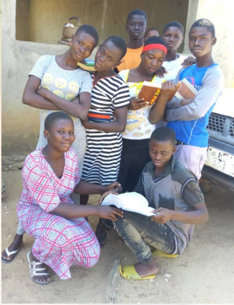
New youth attending the Gurumbelle church