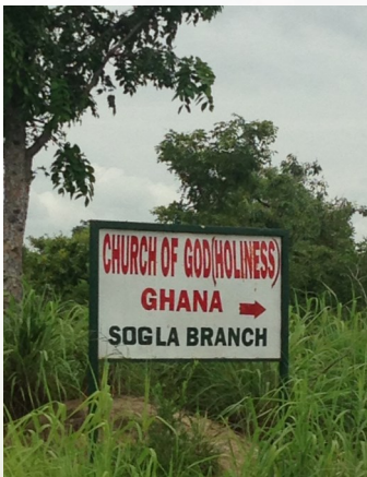
The coming Convention will be held at the Sogla church.

Find us on Facebook: Ghana Church of God Holiness