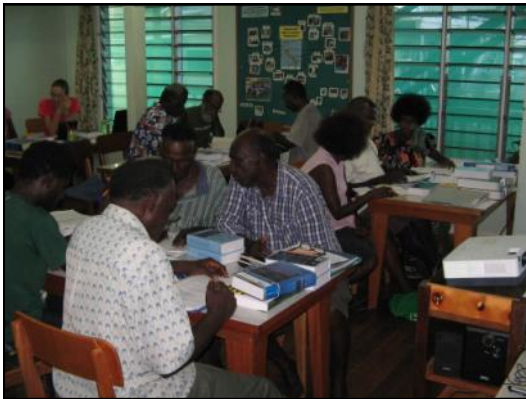
The Solos team (along with a mentor) at TTC1

For six weeks from late May to early July, nine Solos men and women