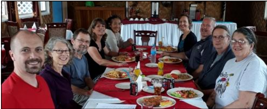
After the RD Meeting in November, most of the crew was able to meet at a local restaurant for fellowship.