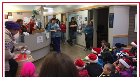
Pictured above is a group of Windrem students singing, playing recorders and playing boomwackers for the Northern Lights Staff and Students.

Windrem Staff and Students would like to thank the following for their contributions and help with the 'Windrem Kindness Elves'. With your generous support the students had a great time spreading some Random Acts of Kindness around our community!