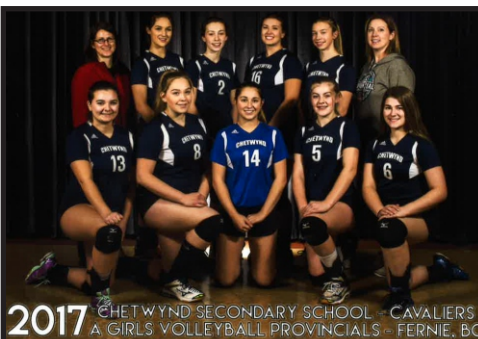
2017 CHETWYND SECONDARY SCHOOL - CAVALIERS A GIRLS VOLLEYBALL PROVINCIALS - FERNIE, BC

The Sr. Girls volleyball team and CSS as a whole would like to extend their gratitude to the business below for their support in getting the team to the Provincial Championships in Fernie BC: