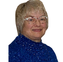
NORMA TOWER 250-788-5388