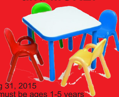
Table w/ 4 chairs Art Supplies and MORE!

July 1 ~ Aug 31, 2015 Preschool must be ages 1-5 years