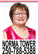
NORMA TOWER 250-788-5388