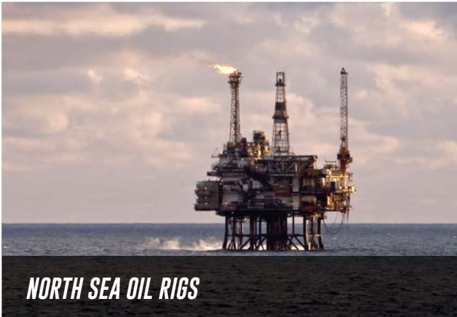
NORTH SEA OIL RIGS

NICEIC REGISTERED CONTRACTORS ARE TRUSTED AND SPECIFIED BY THE ESTATE AND FACILITIES MANAGERS OF HUNDREDS OF SCOTLAND'S MOST IMPORTANT BUSINESSES AND INSTITUTIONS. AS SUCH, MANY OF SCOTLAND'S MOST ICONIC BUILDINGS HAVE BEEN INSTALLED AND MAINTAINED BY NICEIC REGISTERED ELECTRICAL CONTRACTORS.