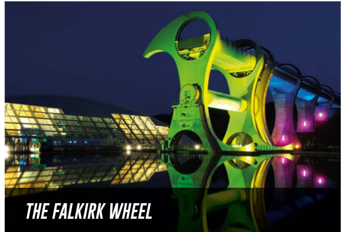
THE FALKIRK WHEEL