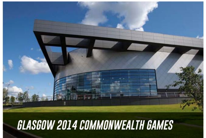
GLASGOW 2014 COMMONWEALTH GAMES