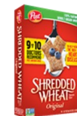
Shredded Wheat Original