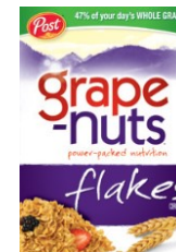
Grape Nuts Flakes