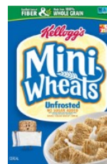
Mini Wheats Unfrosted