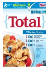
Total Whole Grain