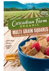
Cascadian Farm Multi Grain Squares