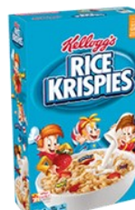
Rice Krispies Original