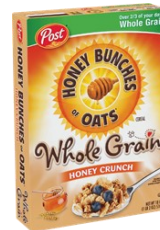
Honey Bunches of Oats Honey Crunch