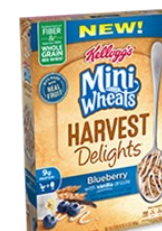
Mini Wheats Harvest Delights Blueberry