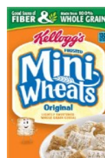
Mini Wheats Original