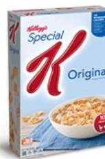
Special K Original