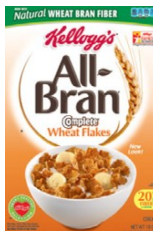
All-Bran Wheat Flakes