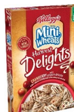
Mini Wheats Harvest Delights Cranberry