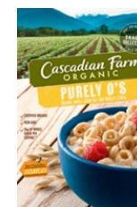
Cascadian Farm Purely O's