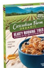
Cascadian Farm Hearty Morning