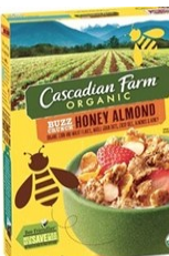
Cascadian Farm Honey Almond