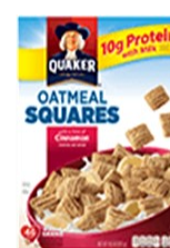
Oatmeal Squares Cinnamon