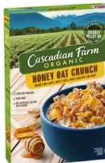
Cascadian Farm Honey Oat Crunch