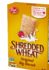
Shredded Wheat Original Big Biscuit