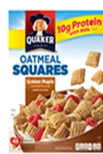
Oatmeal Squares Golden Maple