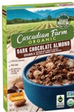
Cascadian Farm Dark Chocolate Almond