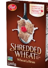
Shredded Wheat Wheat 'n Bran