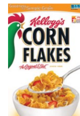
Corn Flakes Plain