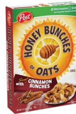
Honey Bunches of Oats Cinnamon Bunches