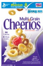
Cheerios Multi Grain