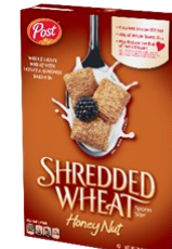
Shredded Wheat Honey Nut