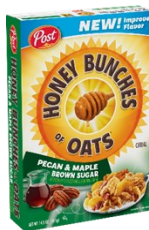
Honey Bunches of Oats Pecan & Maple Brown Sugar