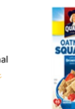
Oatmeal Squares Brown Sugar