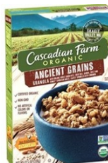
Cascadian Farm Ancient Grains