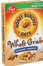
Honey Bunches of Oats Almond Crunch