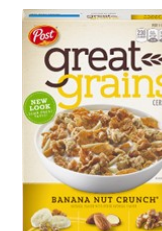
Great Grains Banana Nut Crunch