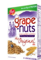
Grape Nuts Original