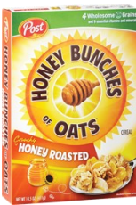
Honey Bunches of Oats Honey Roasted