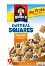
Oatmeal Squares Honey Nut