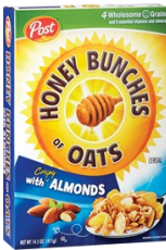
Honey Bunches of Oats Almonds