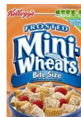
Mini Wheats Bite Size