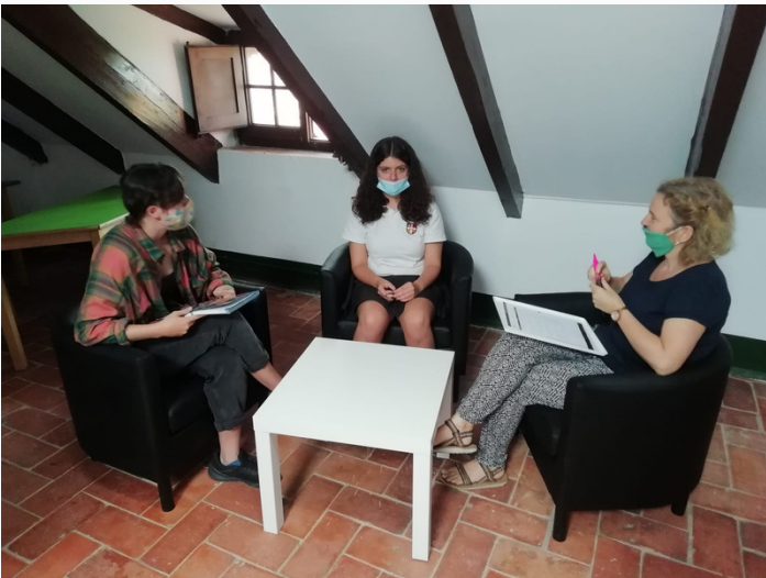
English: Speaking assessment

In the last three weeks, Year 11 have been working on the topic of 'Human Reproduction'. We approached this topic from both a scientific perspective as well as how it impacts our lives socially. It is a delicate topic to discuss in class, however, we believe that it is vital that it is discussed in class. Moreover, it is a key part of the IGCSE requirements.