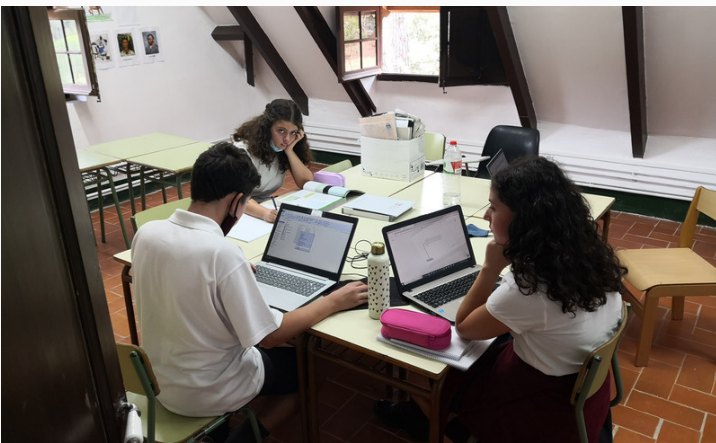
Some students from Key Stage 4 working on various subjects during 'Reinforcement'

There is a dedicated slot in the timetable for students who might either need extra support in some subjects (such as English) and/or students who wish to skip an activity to catch up on their studies. We call this 'Reinforcement'. So far, we have only had two such sessions and I am noticing that it allows the students to clarify a lot of things they might have doubts about. groups are also smaller than they usually are.