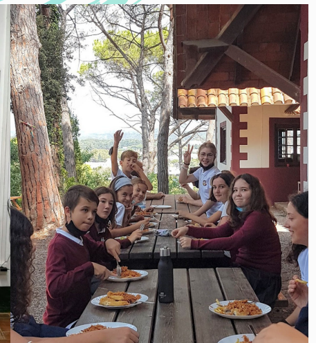
It's lunch time friends!