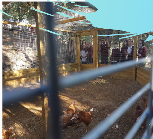
A quick visit to the vegetable garden and our new chickens.