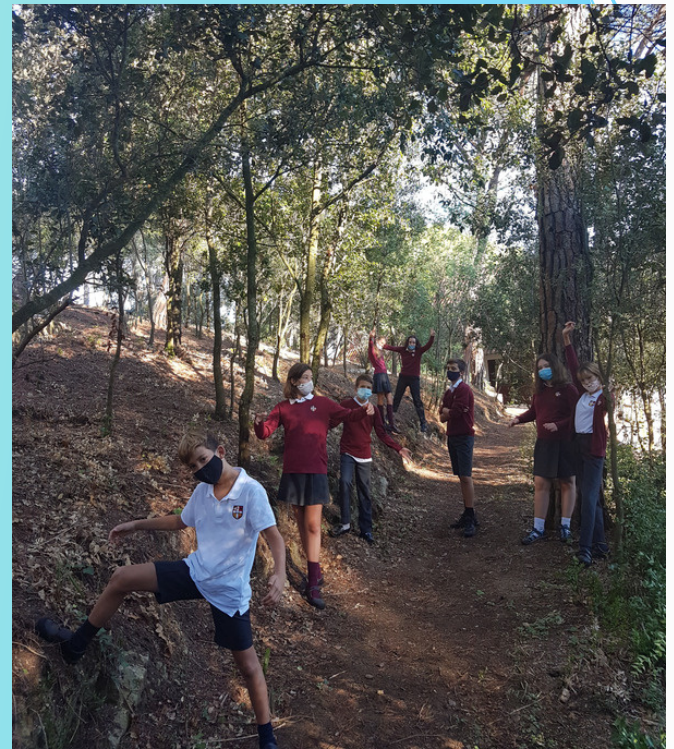
Making friends and posing with style!