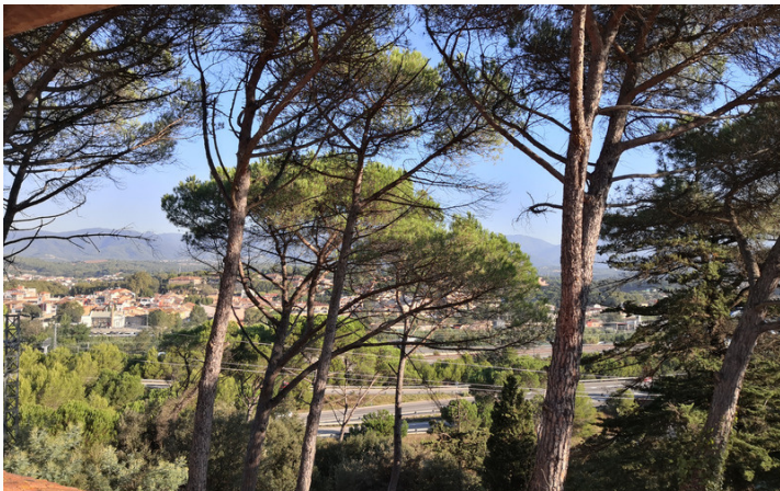
Our lovely view over the Montseny from the classroom window.

A very warm welcome to all Key Stage 4 students, old and new. This year we are lucky to be divided into even smaller groups, enabling us to focus more on our strengths. Key Stage 4, or KS4, will be based in Room I upstairs. The room has a majestic view of the Montseny.