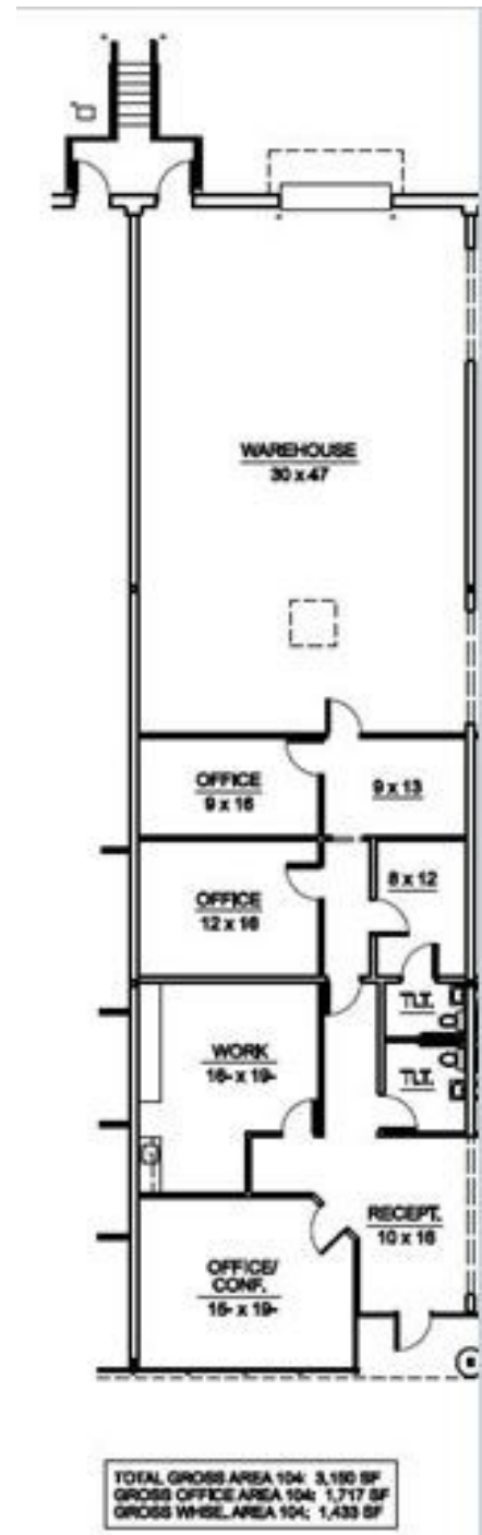
Approximate Floor Plan