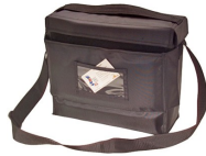
Front & back