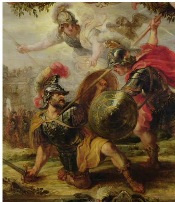
Fig. 1. The painting Achilles Slays Hector by Peter Paul Rubens depicts a scene from the Iliad in which no reference whatsoever is made to conscious decisions or intentions (52). Instead, the pursuits of Achilles and the other characters are determined by external factors, such as fate or the gods. Here we argue that although people may have the feeling that their behavior is the result of their conscious decisions, their goal pursuits too are often directed by external sources of which they are not conscious.

The finding that the pursuit of the goals that we consciously set and adopt is prepared unconsciously, at least in the earliest moments before we act on them, is intriguing. Recent research in social cognition, however, goes even one step further. This research shows that goals themselves can arise and operate unconsciously. Social situations and stimuli in the surroundings activate or prime goals in people's minds outside of their awareness, thereby motivating and guiding them, for example, to work harder on a task (2), to reach out a helping hand to others even when facing obstacles (3), or to ensure