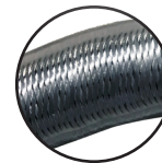
Heavy-duty metal cables with water-proof protective outer coating