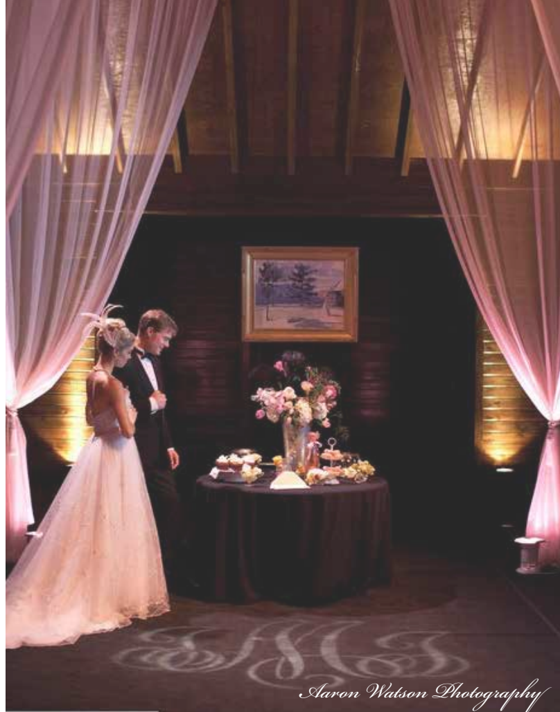
Aaron Watson Photography