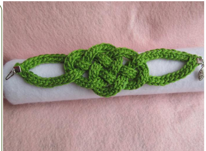
CELTIC KNOT BRACELET

(Note: For a bracelet that is shorter by 6 chs, you will have 8 scs on either side of the knot; For a bracelet that is longer by 6 chs, you will have 14 scs on either side of the knot)