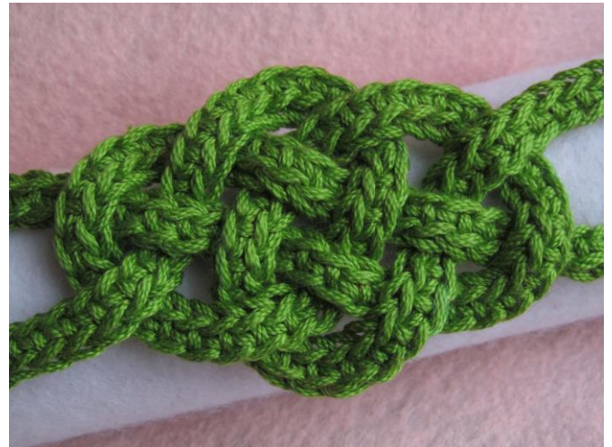
Celtic Knot Bracelet

With Right Side facing up, place 1 crocheted cord end on block lining up the 11 th sc from end with the red star in diagram and secure with a pin.