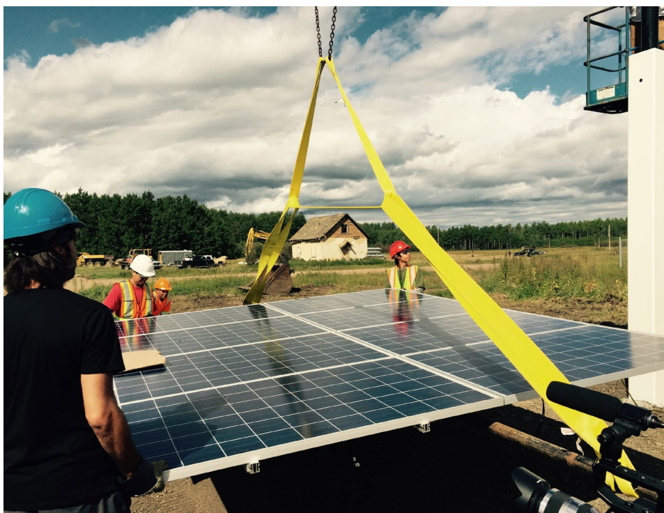
Lubicon Solar Project

Participants discussed how understanding the UNDRIP could support the development of community best practices to climate adaptation and mitigation and enable and support more community involvement – particularly within Elder and youth sectors- in decision making. They put a strong emphasis on the opportunity for elected leadership to incorporate this into the current administrative structures more effectively in order to ensure fair and open processes that address a broader spectrum of issues.