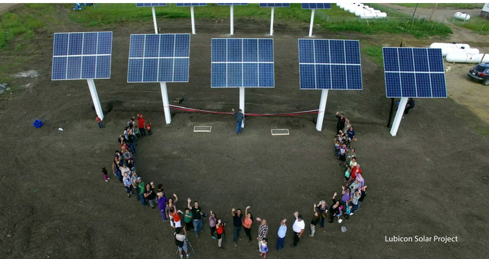
Lubicon Solar Project

Participants indicated that new forms of funding and support for Indigenous-led initiatives need to be initiated in order to diversify from the dependency on