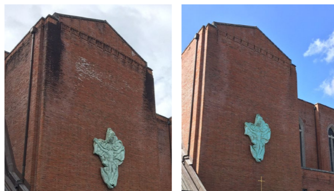
Cleaning the exterior of the Cathedral - Before and After

there had always been a hope that the exterior brickwork of the Chancel, as well as the exterior of the Nave, might have a thorough wash-down that would deal to the decades of accumulated moss and mould. It wasn't quite as easy as "spray and walk away", but the team from Building Wash Services spent nearly a week carefully working their way around the whole building, mostly working from a high-lift crane. They successfully dealt to the moss and mould that had blighted the exterior appearance of both buildings, and that ran the risk of degradation to the cladding, especially the brick and mortar. The difference that the wash-down has made is substantial, and the photos below remind us of the before and after. We were fortunate that the Selwyn's Vision budget could extend to this project as part of the "completion" of the Cathedral.