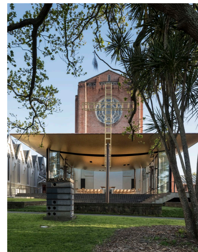
The Bishop Selwyn Chapel.