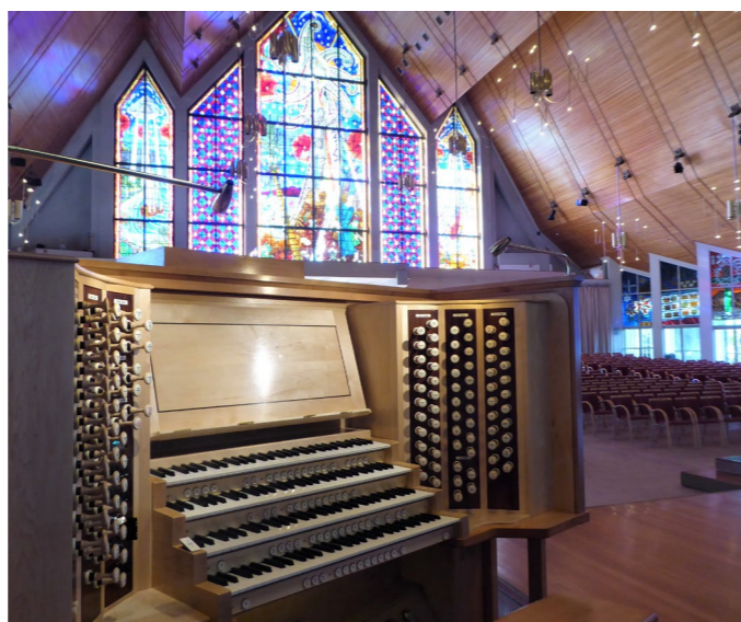
Cathedral Nave Organ Console