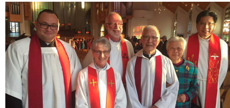
Clockwise from left: