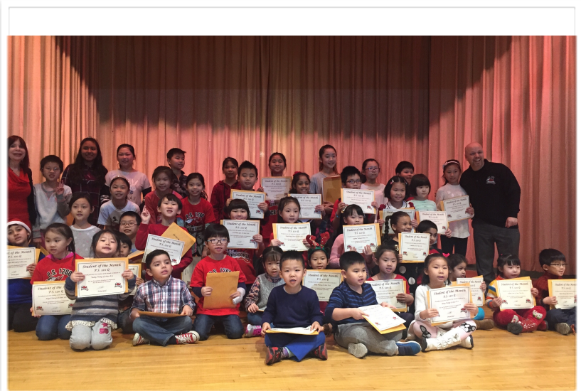
December Student of the Month recipients.