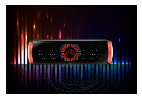
KY/Keumyoung (South Korea) Professional Karaoke Commander KG LiVEN (KMS-S100)