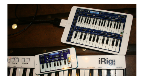
bismark bs-16i Available iOS AppStore