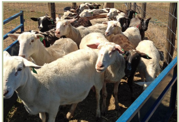
Invest in a handling system.

The benzimidazoles are called the “white dewormers” based on their appearance. This class of dewormers generally has a wide margin of safety. The two benzimidazoles most commonly used in small ruminants and camelids are (1) fenbendazole (Panacur®, Safe-Guard®), and (2) albendazole (Valbazen®). Albendazole is the most potent member of the benzimidazole class. It should not be used in the first 30 days of pregnancy because it can damage the fetus(es). Multiple day dosing of the white dewormers can improve efficacy, if the worms have only low level resistance. However, the resistance level to the benzimidazoles is so high in barber pole and black scour worms in the Southeastern US (and other areas) that multiple-day dosing is now of limited benefit. If albendazole is used for multiple days, it should be used at the recommended dosage.