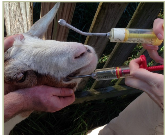
Do not mix dewormers.

likelihood that underdosing is avoided. A pet digital scale for large dogs works well to weigh most goats and sheep. These large dog scales are affordable and portable. Weigh tapes may be accurate for goats. If working with a large herd or flock, invest in an alleyway and weigh scale that rests in a chute system. This investment saves time and labor.