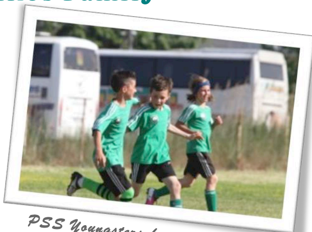
PSS Youngsters having fun

The competitive evaluation of the young athletes is based on strict scientific methods, thus giving the opportunity to the most talented of them to join the academies and the competitive teams of PANATHINAIKOS FC .