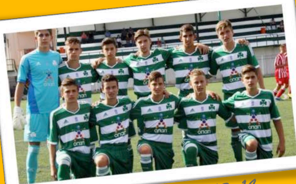
PAO Academy U17 Season 2013-14