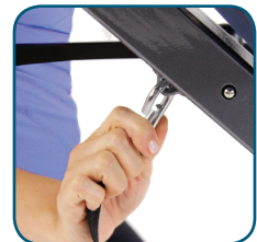
Figure 8 Labeled ② Set Angle right on the equipment!