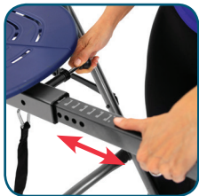
Figure 7 Labeled ① Set Height right on the equipment!