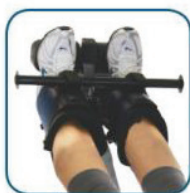
EZ-Up Gravity Boots XL