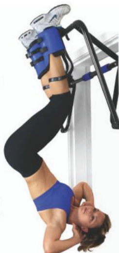
Use with the EZ-Up Chin-up Bar (sold separately) or at the gym!**